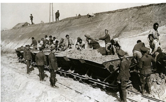
Building roads by CLC, to sustain industrial warfare on Western Front

While labouring long hours in uncomfortable and often hazardous jobs, their stay in Europe was for many their first opportunity to experience life not only outside China but beyond their village or province. As often happens, contact with a different reality prompted more than a few to question their country's place in the world and to wonder how it could be changed. Contact with fellow citizens and with nationals from other Allied nations may have helped the members of the Chinese Labour Corps to develop a sense of national identity and of their country's place in the world.<sup>36</sup> It should also be emphasized that, while originally intended to carry out unskilled tasks, members of the Chinese Labour Corps often ended up being responsible for much more complex tasks, even tank maintenance, overcoming the extensive prejudice that saw them as hard working but incapable of performing technologically-demanding jobs.<sup>37</sup>