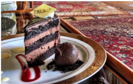
Donald Trump told President Xi of Syria strikes over a "beautiful piece of chocolate cake"

The Daily Telegraph, 7 April 2017 (scan right)