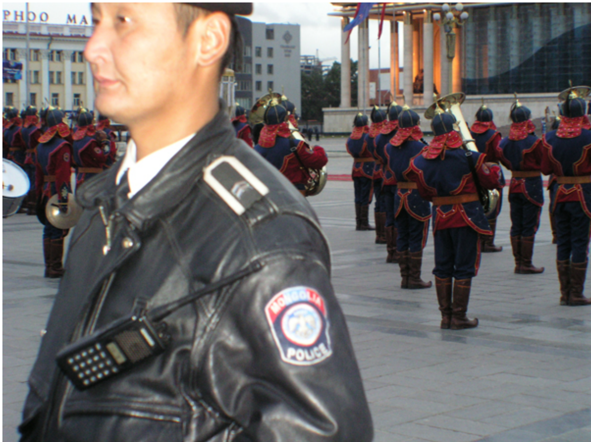
Police and other state security and intelligence agents have become increasingly repressive. Photo at the Parliament building c. Keith Harmon Snow, 2008.

manipulating the government include U.S., Canadian, Australian, European and South African executives with current or former ties to: defense and intelligence sectors; state departments; and Wall Street banks. Many directors have long pedigrees with corporations responsible for genocide and ecocide in Australia, Argentina, Burma, Canada, Chile, Congo, Haiti, Indonesia or the United States.