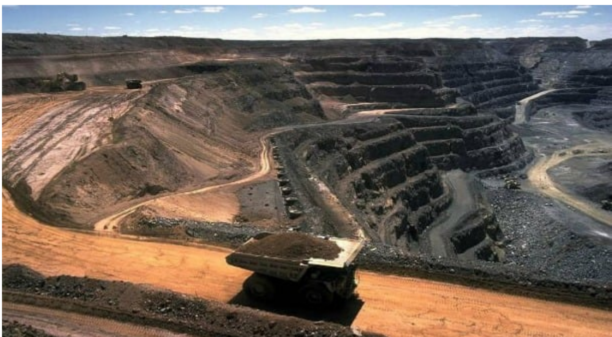
Rio Tinto & Ivanhoe Mines: The Oyu Tolgoi open pit in the Gobi desert.