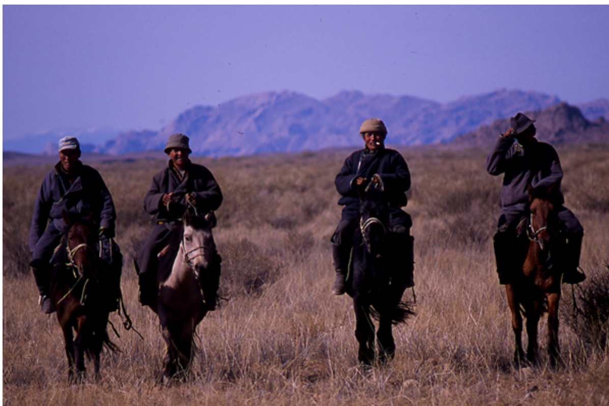
Herder nomads in west central Mongolia.

Decades of grassroots organizing to establish environmental protections were at risk: on September 16 the Great State Khural (State Parliament) gathered with intentions to dismantle the so-called 'Law With A Long Name' (LLN).