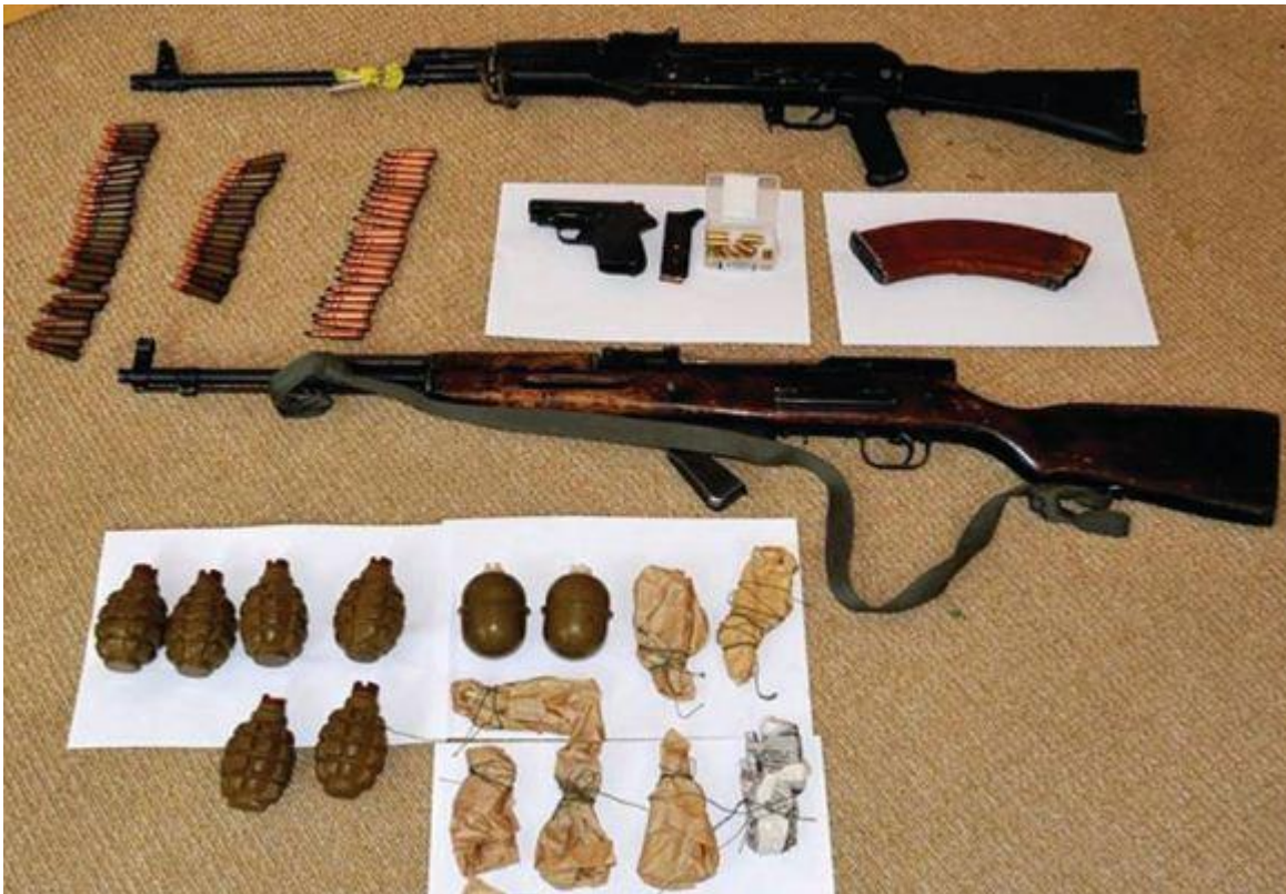
Photos produced by the state security apparatus show weapons, ammunition and explosives alleged to have been confiscated at the time of arrests or discovered during searches later.

The state security apparatus in Mongolia has become increasingly repressive. For example, the son of one of Ts. Munkhbayar's colleagues was killed on 1 July 2008, when thousands of people protested the rigged national elections: police responded with bullets, arrests, tortures, disappearances and secret trials. Five people were killed, the shooters were not identified, the police officers that gave the command were charged 3-5 years. The Western press produced superficial reports, but post-election state-orchestrated violence was in whiteout. [10]