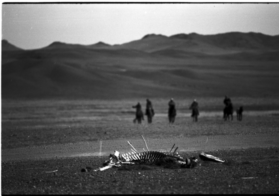
Life for herder on the steppe is hard enough without the toxic pollution and land-grabbing of foreign mining corporations.

Inspections by the State Nuclear Agency found nothing, as expected, since they were merely protecting state interests and the cult of the atom . Tests by the State Veterinary and Animal Breeding Agency revealed chronic poisoning by heavy metals and radioactive isotopes; results posted on the government website soon disappeared. The vet agency refused to release official reports, but some were leaked. Angered by the vet agency's diligence, Mongolia's Prime Minister attacked them, demanding they revisit and 'correct' their results. Millions of Tugrugs later the vet agency produced new results, inconclusive as regards AREVA's uranium mining. The vet agency officials were frightened into silence.