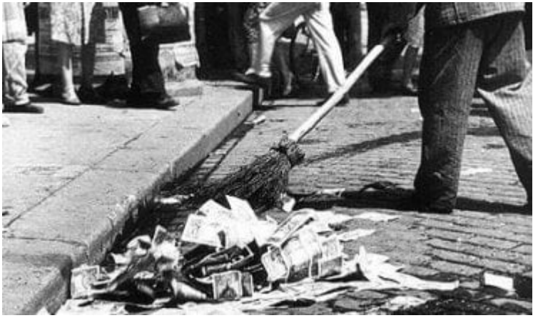
My Summer Reading: Hyper-Inflation in Weimar Germany