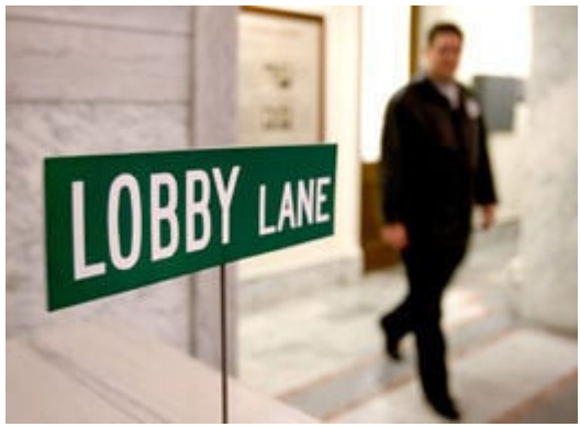
Democracy is Dead ... Lobbyists Rule America