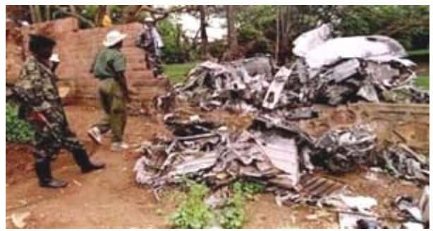
The Rwanda War Crimes Coverup