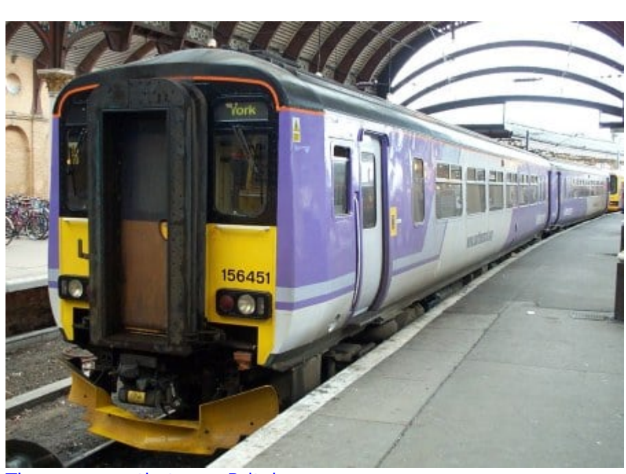
The company that runs Britain