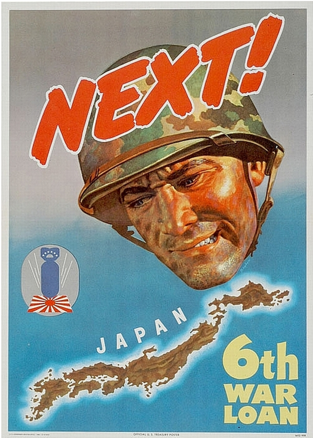
U.S. Treasury poster (1944)