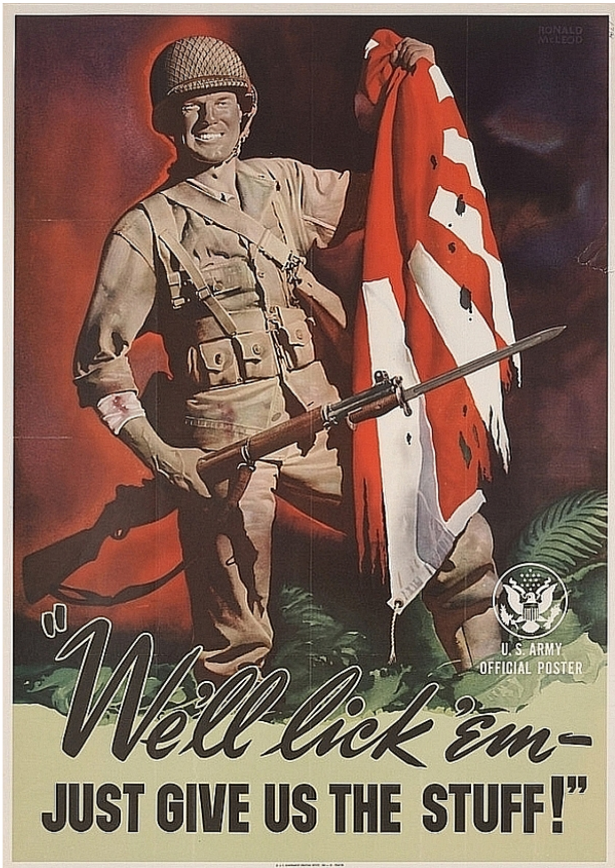
U.S. Army poster (1943)