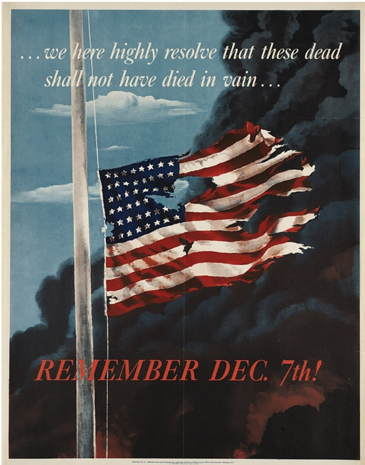
U.S. Office of War Information poster (1942) about the Pearl Harbor attack on December 7th, 1941