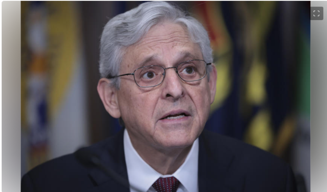
Attorney General Merrick Garland delivers remarks about Justice Department efforts to combat crime on January 5, 2024 in Washington, D.C. Garland faced criticism from conservatives after saying he believes former President Donald Trump should have a "speedy trial" in the federal election interference case.

They have done everything they possibly can to stop Trump, for they KNOW he will do his best to prevent their agenda.