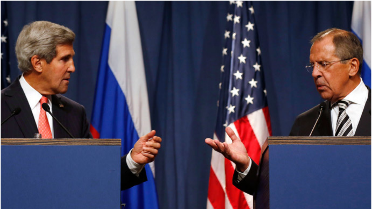
Image: U.S. Secretary of State John Kerry (L) and Russian Foreign Minister Sergei Lavrov gesture, following meetings regarding Syria, at a news conference in Geneva September 14, 2013.

After the UK balked at airstrikes, Moscow and Washington took the diplomatic route, resulting in a historic deal that has seen Damascus abandon its chemical weapons stockpiles .