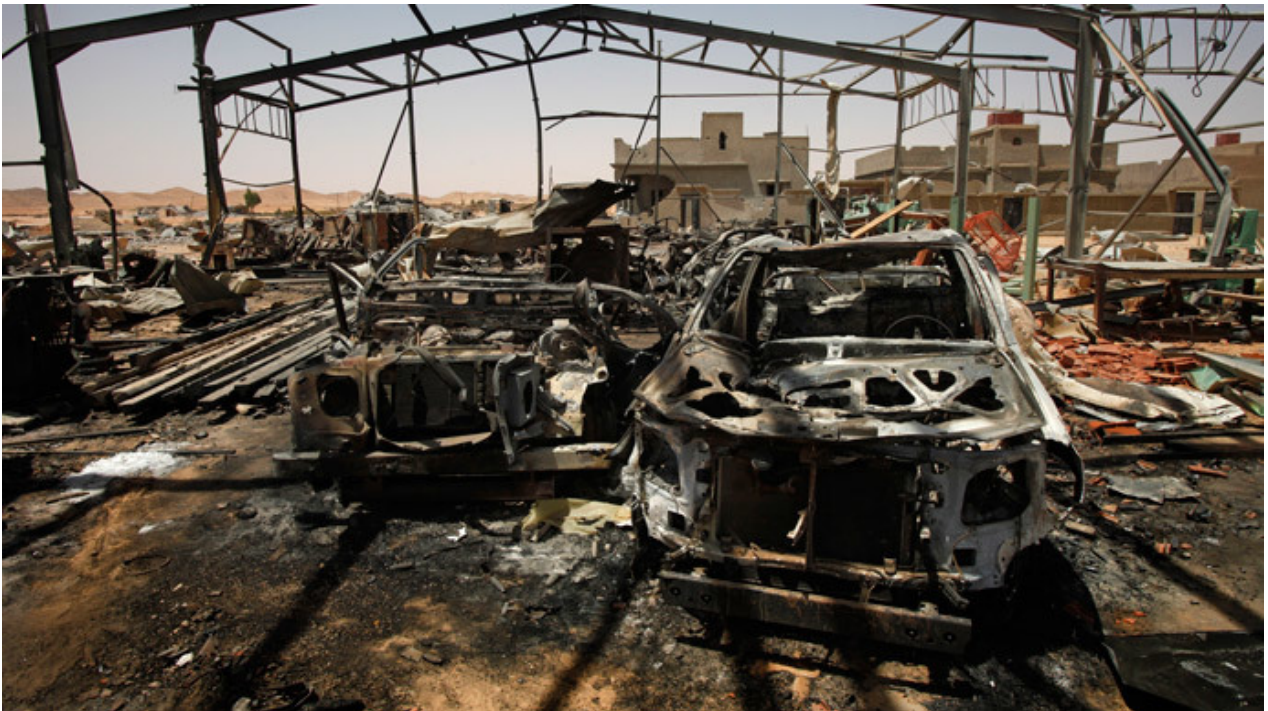
Image: A building used by Gaddafi troops to service vehicles is seen in rubble following a NATO airstrike in the town of Bir al-Ghanam in western Libya, August 8, 2011.

But the real damage to overthrowing the Gaddafi regime came in the ensuing years, with the country descending into a civil war between Islamist forces and the weak post-revolutionary government. In August, Obama admitted his Libyan policy was a failure, but not because he chose to intervene militarily. Rather, he says the problem was that America and its European partners did not “come in full force” to take Gaddafi out. Although his then-Secretary of State Hillary Clinton seemed to rejoice in his death, wryly noting “We came, we saw, he died.”