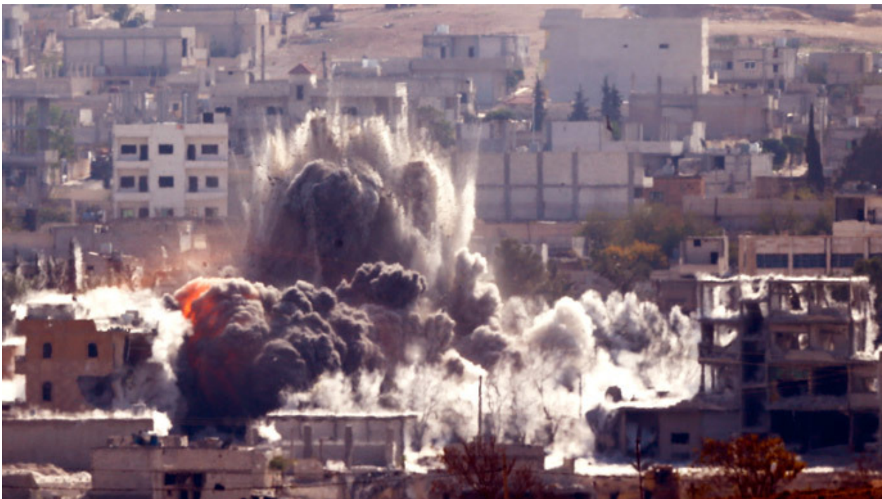
Image: An explosion following an air-strike is seen in the Syrian town of Kobani from near the Mursitpinar border crossing on the Turkish-Syrian border in the southeastern town of Suruc, in Sanliurfa province, October 29, 2014.

Quite a feat for a Nobel Peace Prize-winner.