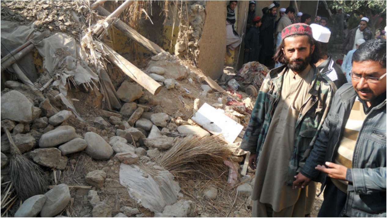
Image: Pakistani Islamic students gather at a destroyed religious seminary belonging to the Haqqani network after US drone strike in the Hangu district of Khyber Pakhtunkhwa province on November 21, 2013.