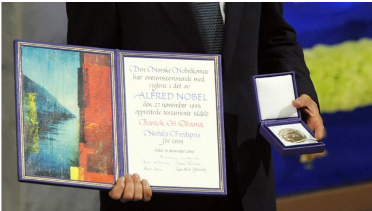
Image: US President Barack Obama holds his Noble Peace Prize during the Nobel Peace Prize Ceremony at the Oslo City Hall in Oslo on December 10, 2009.

Obama didn't start the war in Afghanistan, but he certainly took a page from his predecessors playbook in trying to finish it. He recognized his precarious position at prize time.