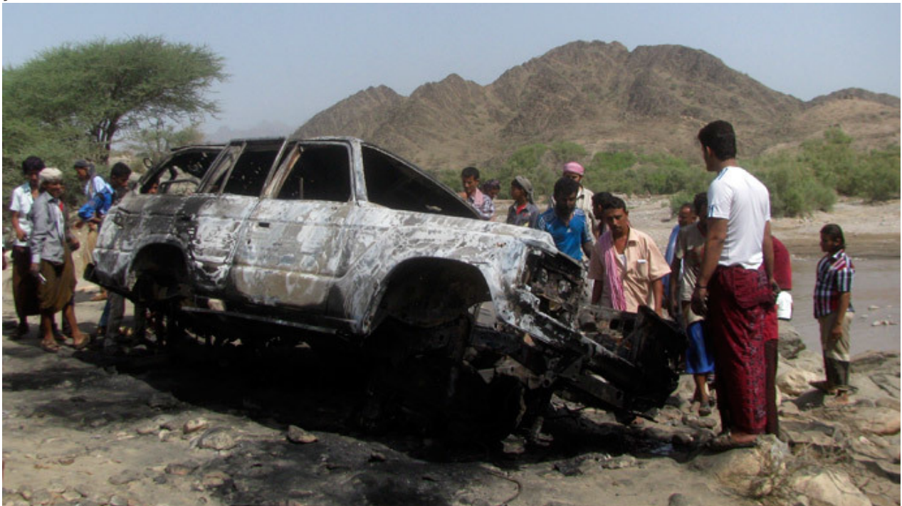
Image: People gather at the site of a drone strike on the road between Yafe and Radfan districts of the southern Yemeni province of Lahj August 11, 2013.

Between 2004 and 2007, only 10 drone strikes were launched in Pakistan. The following year saw 36 such strikes, and 54 were launched in 2009.