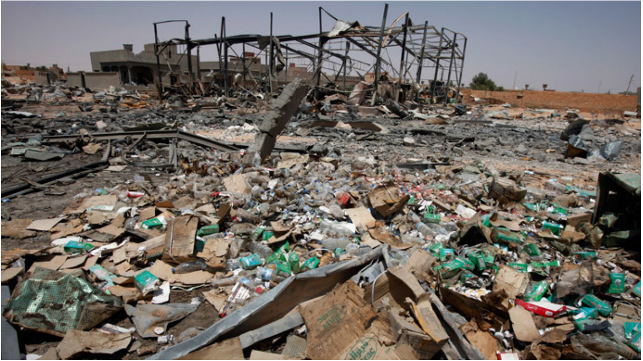
Image: A building used by Gaddafi troops to service vehicles is seen in rubble following a NATO airstrike in the town of Bir al-Ghanam in western Libya, August 8, 2011.

But the real damage to overthrowing the Gaddafi regime came in the ensuing years, with the country descending into a civil war between Islamist forces and the weak post-revolutionary government. In August, Obama admitted his Libyan policy was a failure, but not because he chose to intervene militarily. Rather, he says the problem was that America and its European partners did not “come in full force” to take Gaddafi out. Although his then-Secretary of State Hillary Clinton seemed to rejoice in his death, wryly noting “We came, we saw, he died.”