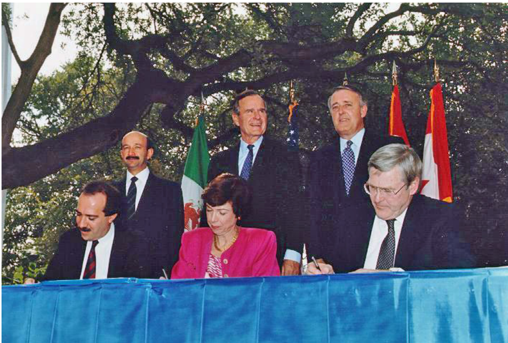
Back row, left to right: Mexican President Carlos Salinas de Gortari, U.S. President George H. W. Bush, and Canadian Prime Minister Brian Mulroney, at the initialing of the draft North American Free Trade Agreement in October 1992. In front are Mexican Secretary of Commerce and Industrial Development Jaime Serra Puche, United States Trade Representative Carla Hills, and Canadian Minister of International Trade Michael Wilson.