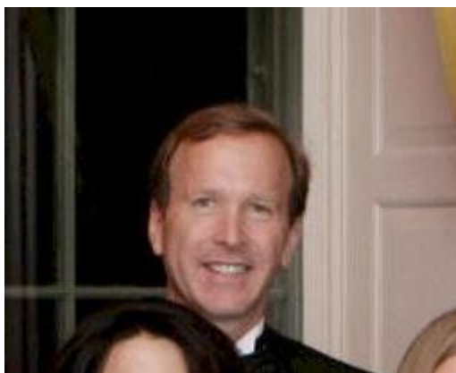
Neil Bush

In the 1980s, George W Bush's younger brother Neil was involved in the Savings and Loan scam. According to the Los Angeles Times, other members of the Bush family were also involved: