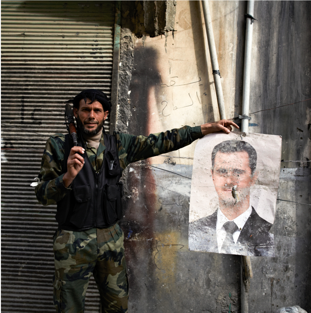
An FSA fighter holds a bullet riddled poster of President Assad in Aleppo, Syria, March 30, 2013.