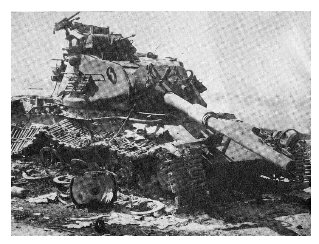
An Israeli M60 Patton tank destroyed in the Sinai (Licensed under the Public Domain)

M. Anwar al-Sadat, a President of Egypt (1970–1981),[iii] offered a peace initiative in the form of his proposal to sign an agreement with Israel according to which, Israel would return to Egypt all occupied territories in the war in 1967. However, Israel, backed by the US, refused to withdraw to the pre-1967 armistice lines. Al-Sadat being frustrated and anxious to retain his credibility in both Egypt and the Arab world, decided to solve the problematic issue through military conflict with limited and defined political objectives.