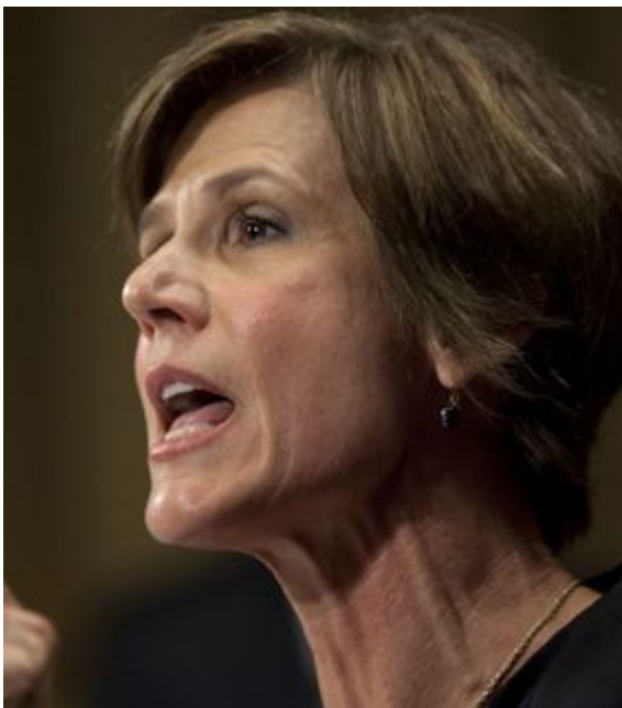
Image: Deputy Attorney General Sally Yates

None of these assertions should be accepted at face value. For 15 years, the threat of imminent terrorist violence has been used by the US government to bully the public and justify a sustained assault on democratic rights. Meanwhile, the relationship of the same state agencies demanding anti-democratic measures to those who have actually carried out terrorist attacks—from 9/11 to the Boston marathon bombing—has never been seriously investigated.