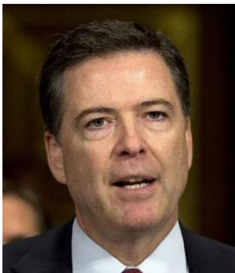
Image: FBI Director James B. Comey

In his joint statement with Yates to the Senate Judiciary Committee, Comey said, “Our goal at the Department is to work collaboratively and in good faith with interested stakeholders to explore approaches that protect the integrity of technology and promote strong encryption to protect privacy, while still allowing lawful access to information in order to protect public safety and national security.” In other words, the FBI and Obama administration want to establish a legal and technical framework—with the support of Congress and powerful corporate interests—to further undermine democratic rights by breaking into widely used security methods with special access technologies.