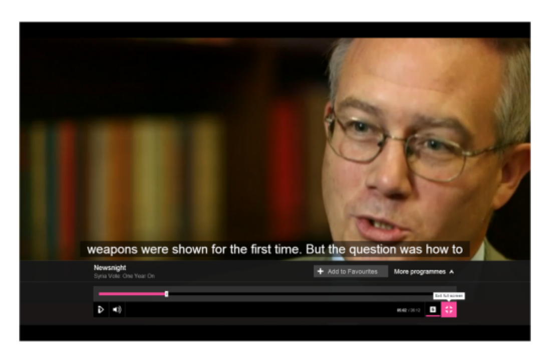
"Napalm bomb" footage included in both broadcasts (3:00 - 3:20)