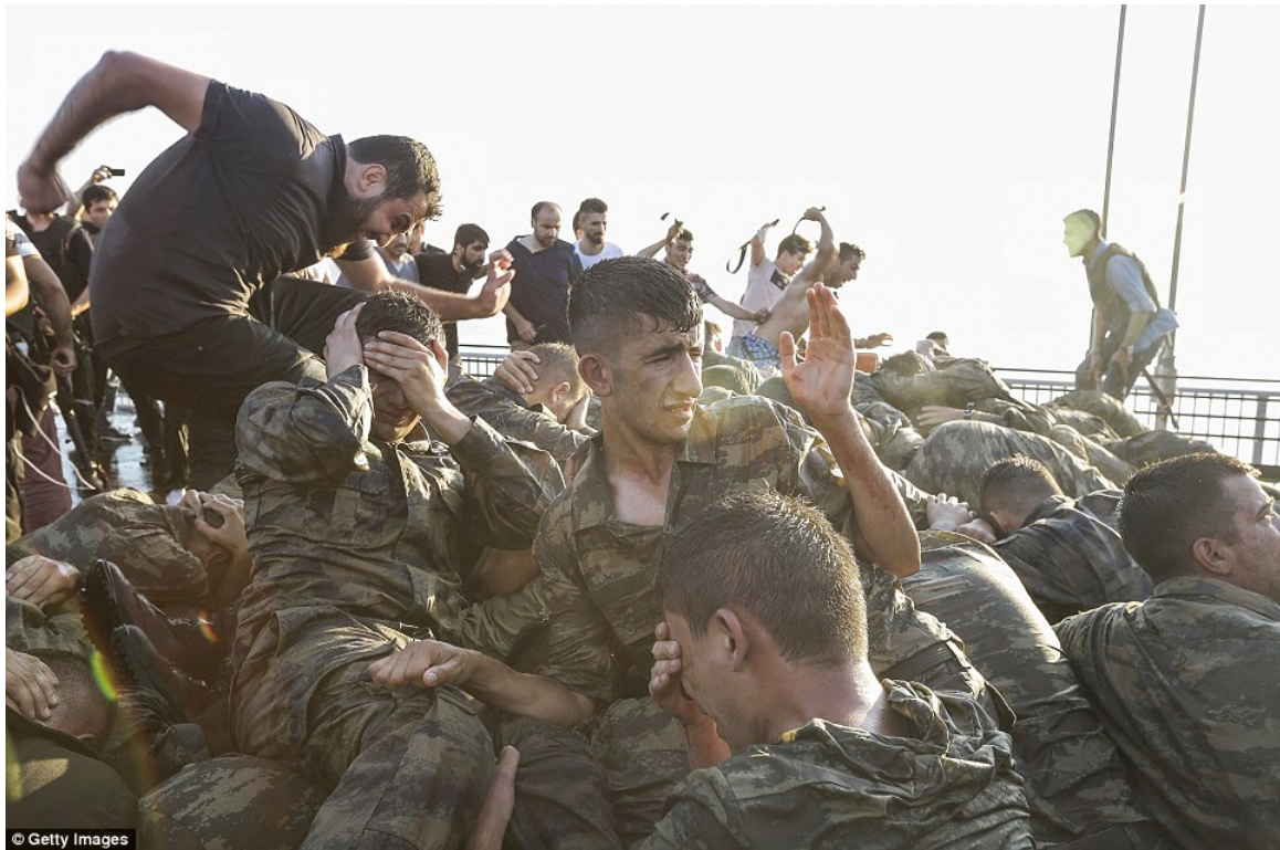
Soldiers surrendering, beaten up by supporters of Erdogan

Combining the previous points with a simplistic explanation that Erdogan would have foiled a CIA coup organized by Gülen for his recent change of opinions on Syria and Putin is wrong, in my view, for the following reasons: