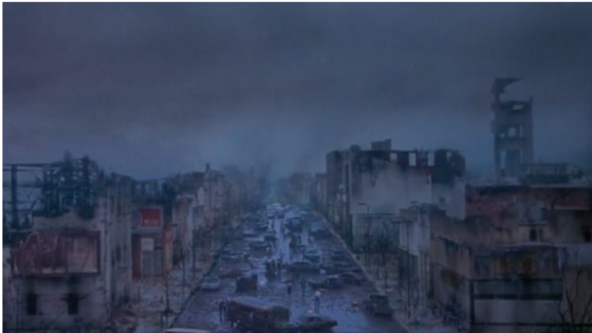
Aftermath of the nuclear attack on Lawrence depicted in The Day After .