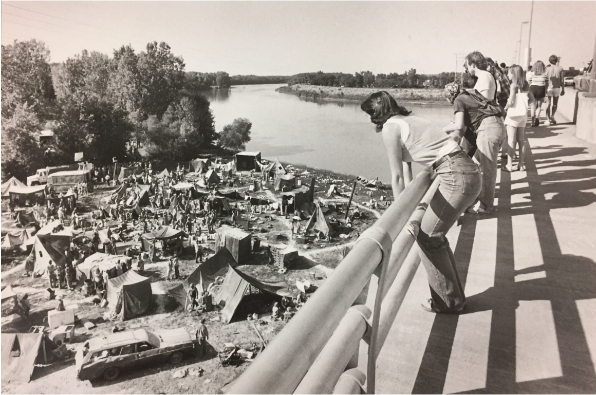
The “refugee” tent city created for The Day After along the banks of the Kansas River.