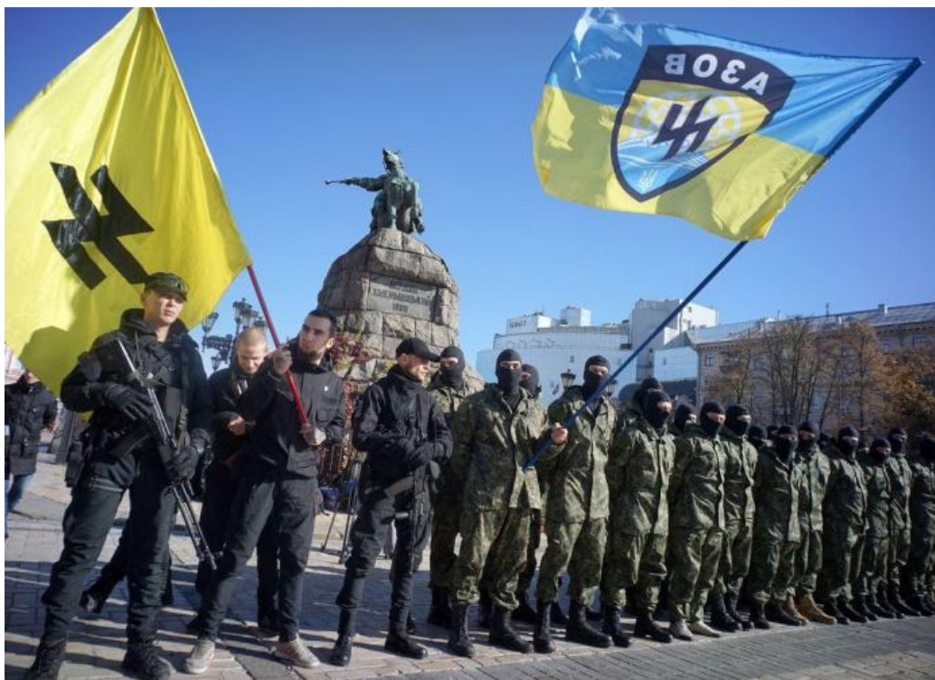
Members of the Azov battalion in Kiev.

that Putin, in his speech relating to the recognition of the Donbass republics, does point out that Kyiv has been constantly attacking innocent civilians in that region since 2014.)