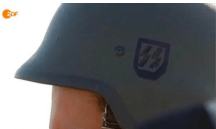
Nazi symbol on Ukrainian soldier's helmet

While it is clear that Biden wants war in Ukraine so bad he can taste it, though it is not in the interests of Kyiv to escalate the Ukrainian attacks on civilians.