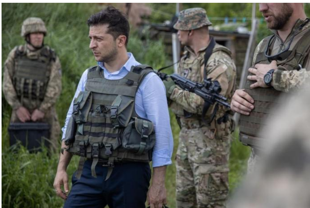
Ukrainian president Volodymyr Zelensky at the front.

“they always lie. We know it is them shelling because no one can but them—though I don’t know how they can do that to their own Ukrainian people, we used to live together and communicate.”