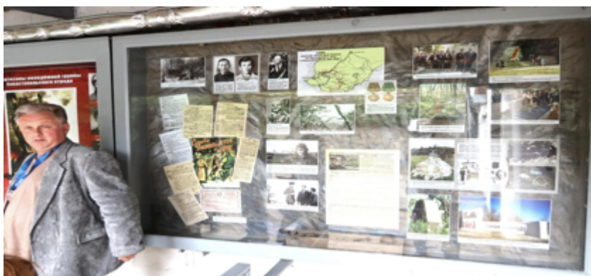
Partisan Museum in Sevastopol.

In Sevastopol we visited the Partisan Museum which is a house where anti-fascist Crimeans organized resistance to the Nazi occupation. The house had a hidden basement where fliers were printed and partisans organized the sabotage campaigns.