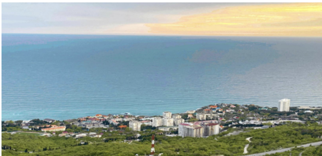
Crimea has rugged but beautiful coastline.

During our trip, we visited the three major cities of Simferopol, Sevastopol and Yalta.