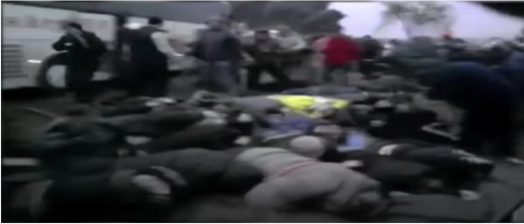
Crimean Bus Passengers were beaten with seven killed on 20 February 2014.