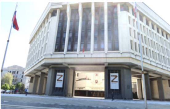
Crimea Parliament in the capital Simferopol