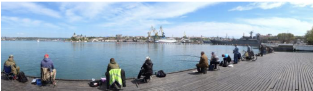
Fishing from dock in Sevastopol..... Russian Navy vessels in distance.

When Ukraine seceded from the Soviet Union in 1991, Russia negotiated a long term lease for the naval port. The Russian military has been in this port for 240 years. Along with Russian navy ships, there are locals fishing from the docks. There is a laid back, casual air to the port although the war hit close to home when Russia’s naval ship “Moskva” was sunk early in the conflict.