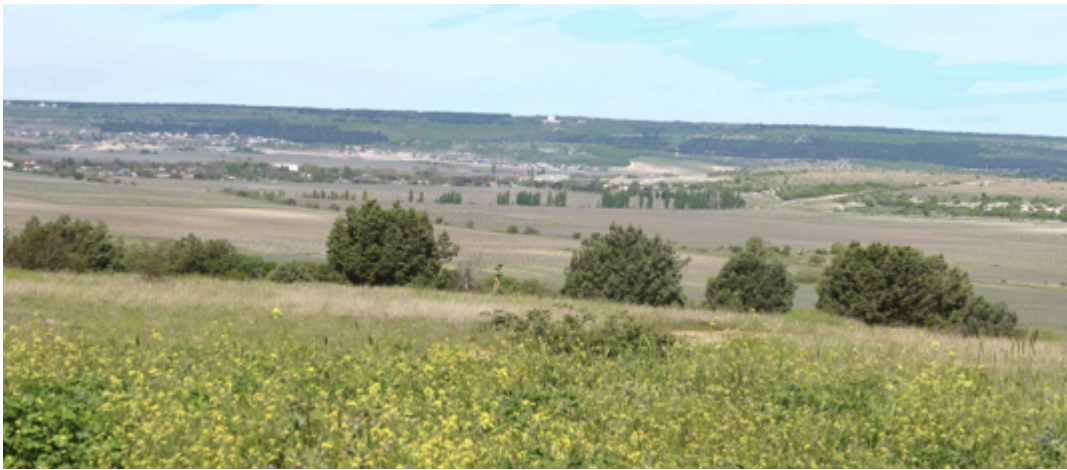
Crimea War “Valley of Death” today.