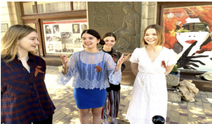
Theater students sing patriotic songs on the street, 6 May 2023.

Simferopol is an inland city with about half a million residents. There are universities as well as Crimea's parliament and industry. When we visited it, most people were enjoying the holidays. We saw multiple groups of teenagers singing patriotic songs on the street and in front of memorials. It is difficult to imagine something comparable happening in the US or Canada. The difference may be partly the result of education but it also shows the different consciousness and experience. Approximately 1 in every seven citizens died in WW2 so every family in the Soviet Union lost family members. The Nazi invasion and occupation were horrible, real and impacted every one.