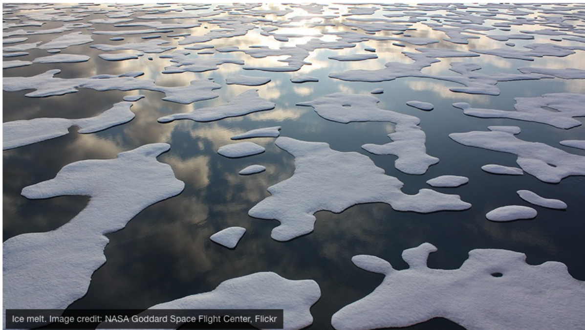
Ice melt.

In true Orwellian Newspeak fashion, the “powers to be” have changed the language, from “climate change” and “global warming” to “electricity power prices”, namely from the future of life on Earth to the hit pocket nerve, a Faustian Bargain which underpins the sacrifice of future generations and much of nature.