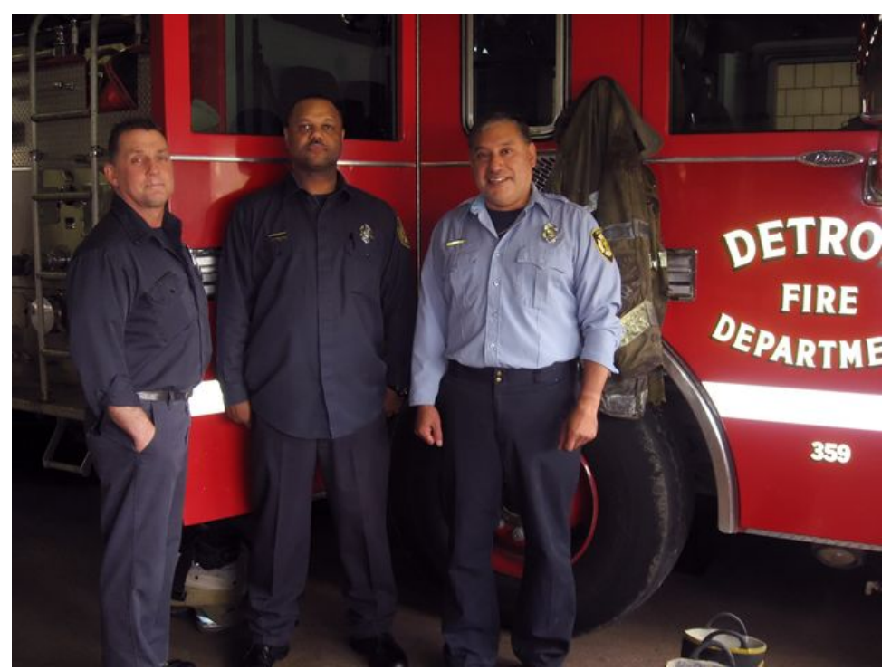
Firefighters from Detroit station that responded to the explosion

"We don't have the equipment we need to fight the fire as a result of the budget cuts. We don't have foam to put out chemical fires so we had to use Marathon equipment to put out the fire. Without that equipment, we'd piece together what we could, but the dangers are that much higher.