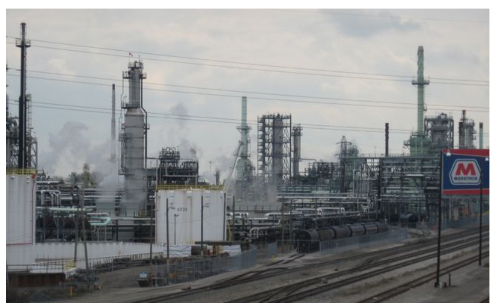
Marathon Oil's Detroit refinery

A tank of sour water, a mixture of hydrogen sulfide and ammonia generated from refining crude oil, exploded at the Marathon Detroit Refinery in southwest Detroit during maintenance work Saturday evening. No injuries have been reported. It is unclear whether the maintenance check or some other factor sparked the explosion.