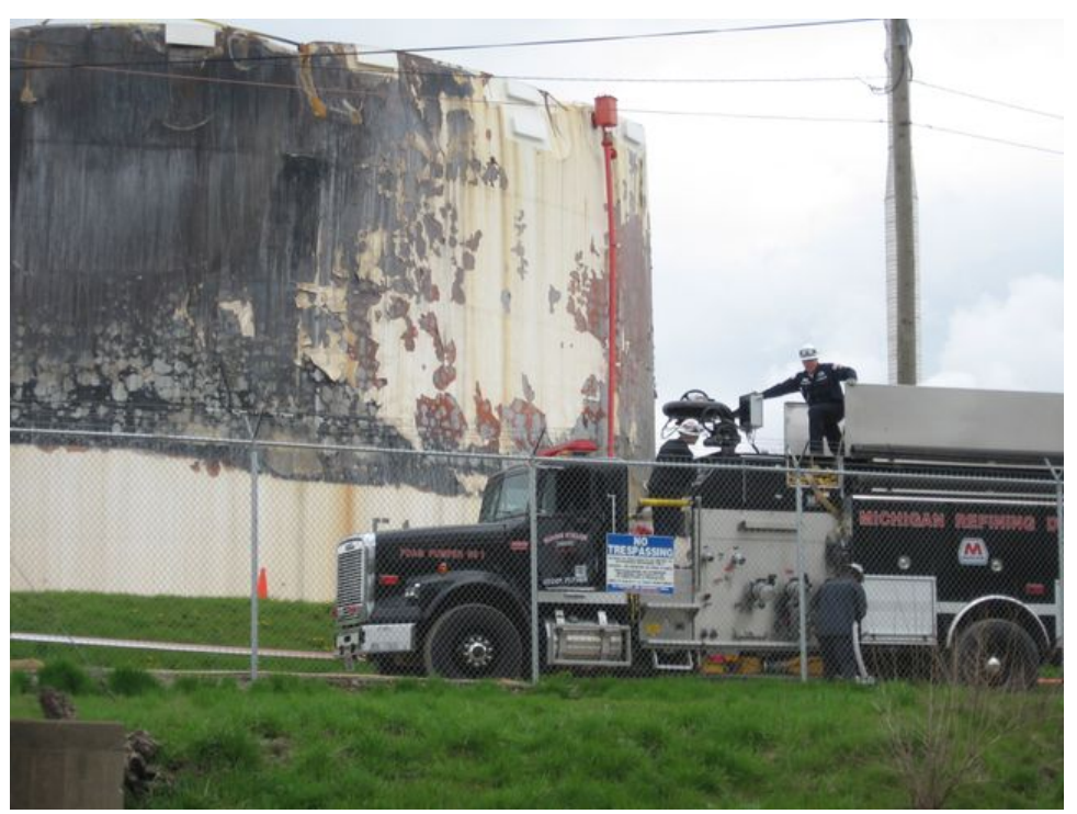
Marathon cleanup workers by tank that exploded

Although officers evacuating residents wore respirators to shield against possible toxins, similar protection was not given to residents. It is not clear the scale of toxic chemicals, including carcinogens, released into the environment as a result of the fire.