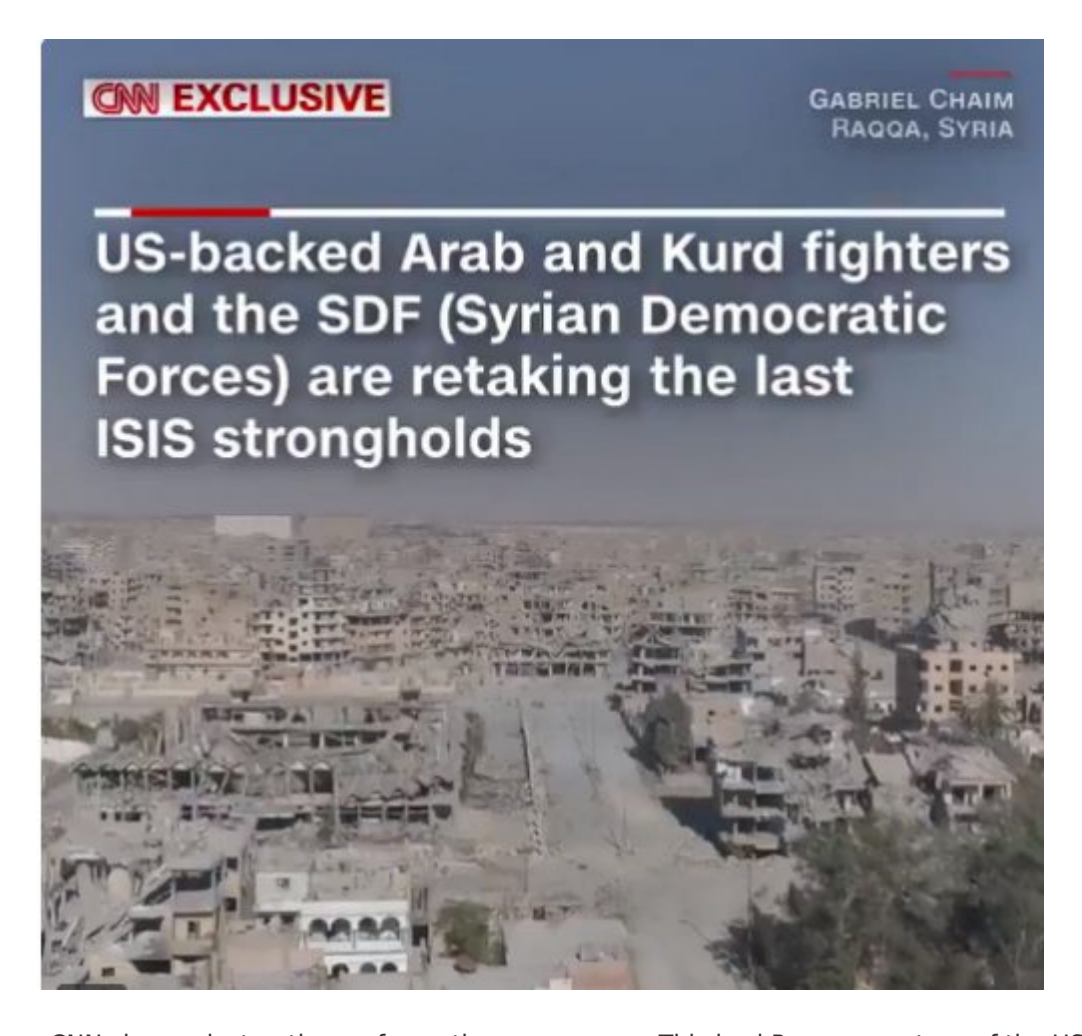
CNN cheers destruction as far as the eye can see. This is al Raqqa, courtesy of the US-led war criminal coalition.

Have the warmongering media had a Trumpian epiphany against perpetual war?