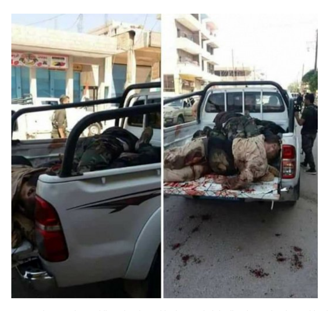
Imagine American soldiers slaughtered in the US, their bodies dumped & the world writing about "moderate American opposition."

Note that the western condemnations of Erdogan do not mention the destruction of vital infrastructure, the bombing of homes, do not note that the attacks are against the country of Syria.