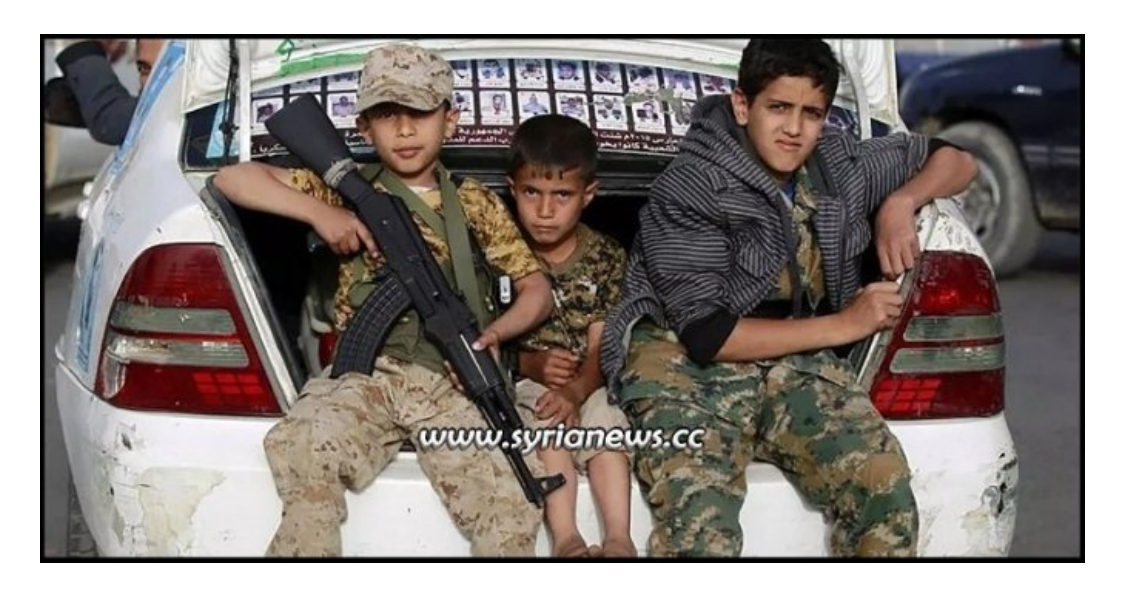
US-run 'SDF' continues to kidnap Syrian children to make them 'soldiers.' [Archive]