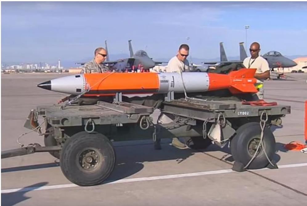
B61-12 guided nuclear bomb