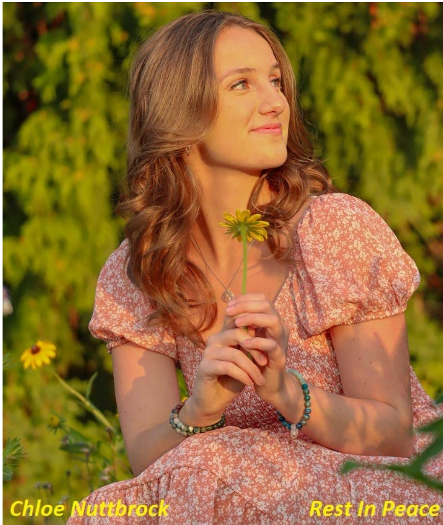
Rice Lake, WI – 6 high school student deaths (posted on April 21, 2023)