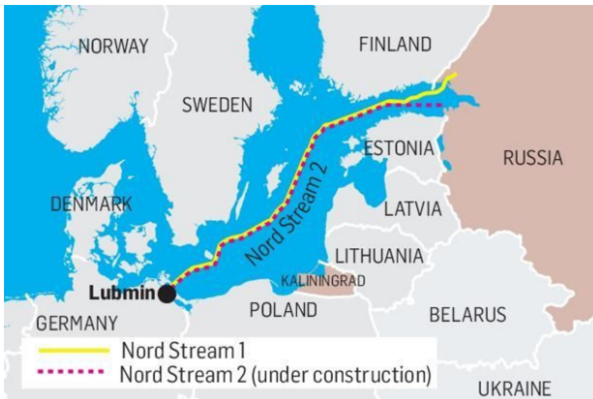
Map of Nord Stream 1 and 2

But Hersh's account omits some important details. Ordered by Washington, Germany had canceled finalizing Nord Stream Pipeline 2 way before the undersea gas-ducts were blown up. At that time, international gas prices rose by 8%, since the world at large was thirsty for the now "freed" Russian gas. So, Russia had no shortage of demand.