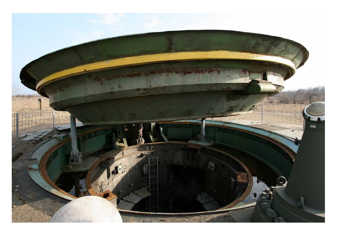
Missile silo in the Central Ukraine for a SS-24 missile

But this time was not without it's moments. January 25, 1995 saw a high altitude Norwegian missile exercise that was detected by the Russian Air defense system. The trajectory was on course for Moscow. Russian President Boris Yeltsin was handed a brief case with the nuclear codes in them and in a matter of minutes had to make a decision. If this test had been done with missiles from the INF treaty, the amount of time that Yeltsin would've had to make his decision would go from 30 minutes to about 5 minutes. In all likelihood, the INF treaty had saved the world from mutually assured destruction. Without arms control, it would be a world gone MAD.