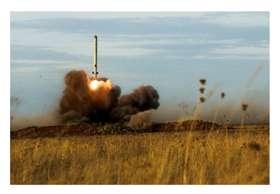
Test launch of the Russian SCC-8 Missile, accused of violating the INF Treaty

The Open Skies Treaty, while negotiated in 1992, did not go into effect until 2002. In August of that year, the first Russian planes would fly over the U.S. in accordance with the treaty. U.S. planes flew over Russia later that year. But the international community would soon place a double standard on Russia. In 2006, Latvia suspended flights over it's territory for one month for NATO ministers visiting the country. In April of 2008, several religious holidays lined up to create a shortage of hotels for visiting groups and Russia asked for a one-week delay in overhead flights. The U.S. accused Russia of violating the terms of the treaty, while Latvia received no such condemnation.