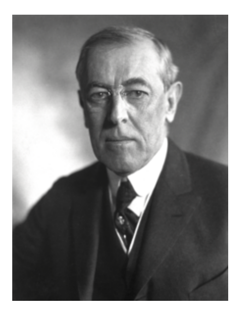
President Woodrow Wilson

It is not by chance that today's western US-dollar based monetary system, with its center, the Federal Reserve (FED), has been created just at the onset of Phase I of the Hundred Year war, i.e. WWI. In 1910, Rhode Island Senator, Nelson Aldrich, with his heart close to the world of bankers, organized a "hunting trip" for five top Wall Street (WS) bankers to travel in disguise by train to Jekyll Island, off the coast of Georgia, where they concocted in a few days the concept of the modern FED – which was to become the 'mother' of the new dollar-based world monetary system, now reduced to the western monetary system. The Federal Reserve Act was signed into law in December 1913 by President Woodrow Wilson.