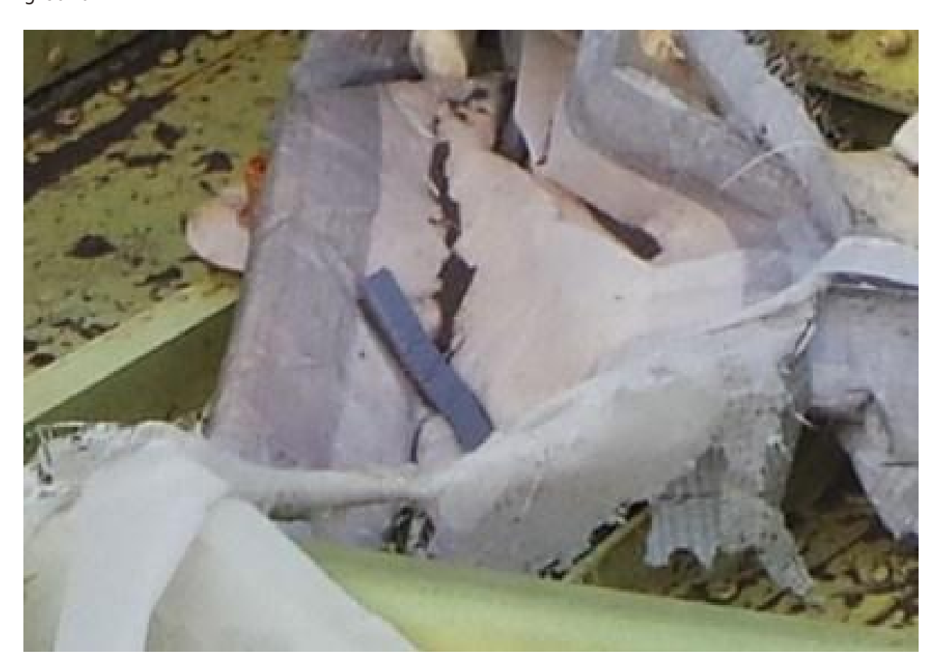
Rod from what experts believe is the air-to-air missile that shot down the MH17 flight.

Another witness reported to a Dutch police investigator in July 2015 that he had seen two Ukrainian Air Force fighter jets in the air at the time of the shootdown and a plume moving horizontally across the sky indicating an air-to-air missile launch, not a missile fired from the ground. [18]