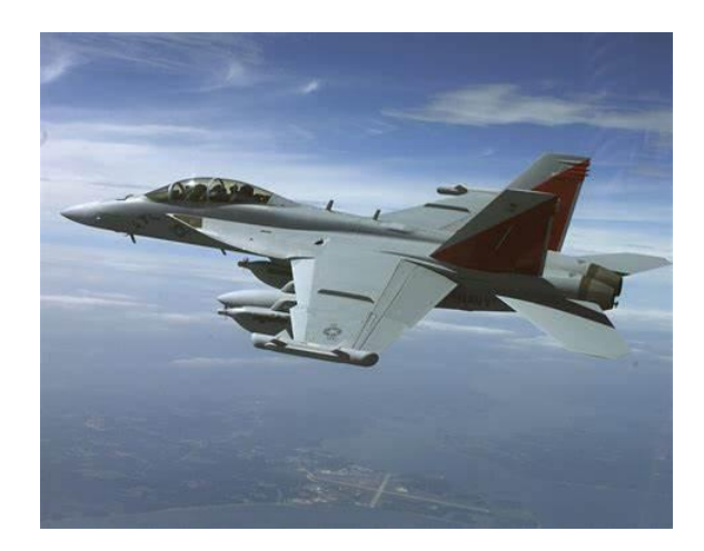
Image: Boeing EA-18G Growler.

Sea Breeze, according to Madsen, included the AEGIS-class guided missile cruiser USS Vela Gulf . From the Black Sea, "the Vela Gulf was able to track Malaysia Airlines MH17 over the Black Sea as well as any missiles fired at the plane." As well, U.S. AWACS electronic intelligence (ELINT) aircraft were also flying over the Black Sea region at the time of the MH17 fly-over of Ukraine.