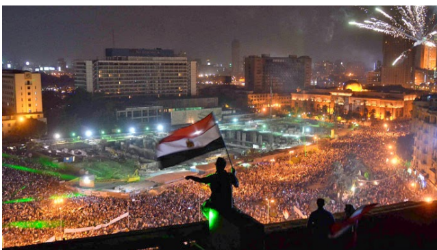
Image: Protests in Egypt.

In January of 2011, we were told that “spontaneous,” “indigenous” uprising had begun sweeping North Africa and the Middle East in what was called the “Arab Spring.” It would be months before the West’s media would admit that the US had been behind the uprisings and