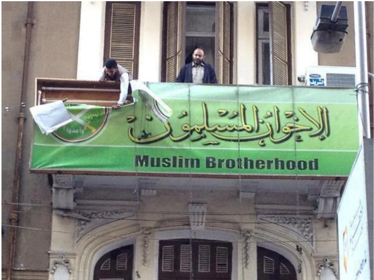
Image: Backlash against the Brotherhood. Despite the Muslim Brotherhood's political success, it represents a violent, loud, minority that is quietly opposed by the vast majority of not only Egyptians, but Arabs across North Africa and the Middle East. Its high level of organization, immense funding provided by Saudi Arabia, Qatar, and even the West, including Israel, allows it to perpetuate itself in spite of its unpopularity, while its violent tactics allow it to challenge dissent.

Today, the Western press decries Egyptian and Syrian efforts to curb these sectarian extremists, particularly in Syria where the government was accused of having “massacred” armed Brotherhood militants in Hama in 1982. The constitutions of secular Arab nations across Northern Africa and the Middle East, including the rewritten Syrian Constitution , have attempted to exclude sectarian political parties, especially those with “regional” affiliations to prevent the Muslim Brotherhood and Al Qaeda affiliated political movements from ever coming into power.