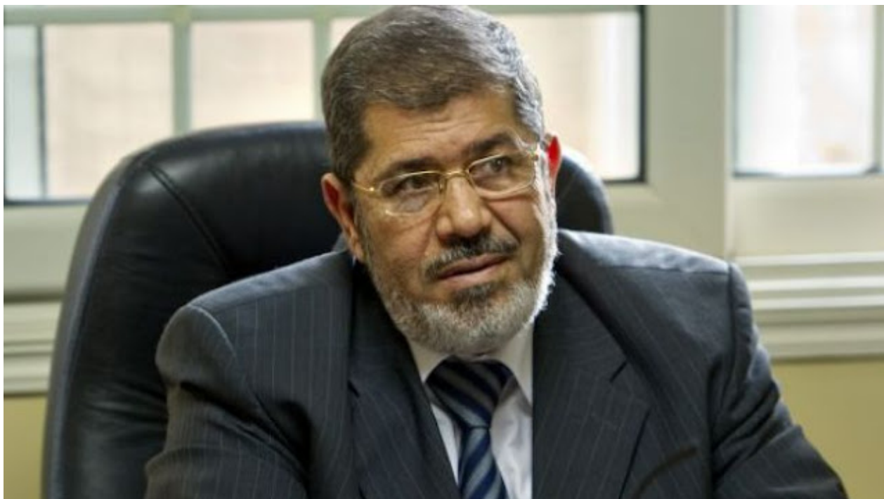
Image: Mohamed Morsi – hardly a “hardline extremists” himself, he is the embodiment of the absolute fraud that is the Muslim Brotherhood – a leadership of Western-educated , Western-serving technocrats posing as “pious Muslims” attempting to cultivate a base of fanatical extremists prepared to intimidate through violence the Brotherhood’s opposition. Failing that, they are prepared to use (and have used) extreme violence to achieve their political agenda.

The Muslim Brotherhood's role was hidden in plain site. While the Western media focused on the more presentable "pro-democracy" leaders it had trained and put at the head of the mobs in Tahrir Square, it was the Muslim Brotherhood's large membership that filled the rest of the square . They were also responsible for launching armed attacks across Egypt leading to the "revolution's" 800+ death toll.