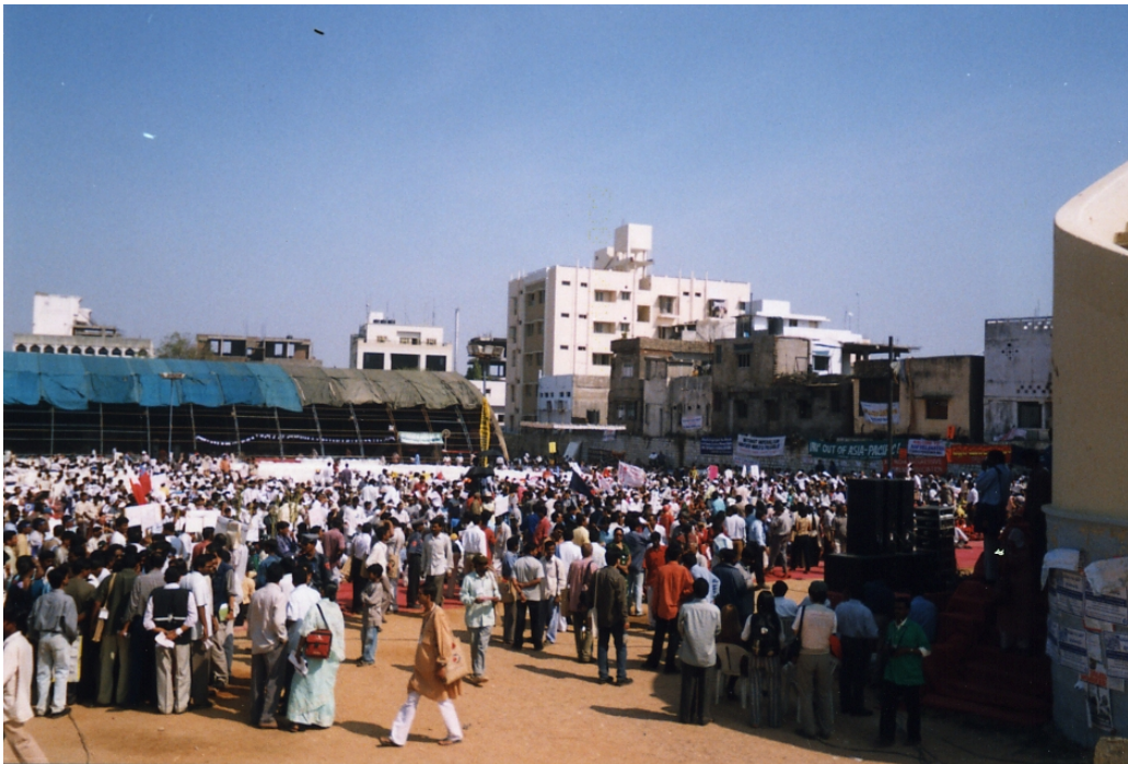
ASF main venue (Licensed under CC BY-SA 2.5)