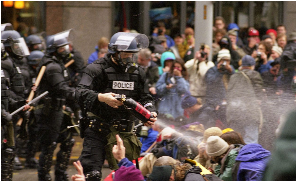
WTO protests in Seattle, November 30, 1999 Pepper spray is applied to the crowd. (Licensed under CC BY-SA 2.0)

From the start the protesters had to face considerable repression. At Seattle-1999 tear gas (canisters were sometimes fired at protesters' faces), truncheons, plastic bullets and concussion grenades were used. Over 600 were arrested, often merely for handing out or even receiving leaflets within the giant "no-protest zone"; the national guard was called out; night-time curfew and martial law were declared. At Davos 2000 and 2001, the police used water throwers (at below-freezing temperatures), tear gas and warning shots; at Washington April 2000 tear gas, pepper gas (some demonstrators were sprayed in the eyes) and truncheons; at Nice, stun grenades and tear gas; at Quebec, water-throwers, tear gas and rubber pellets.