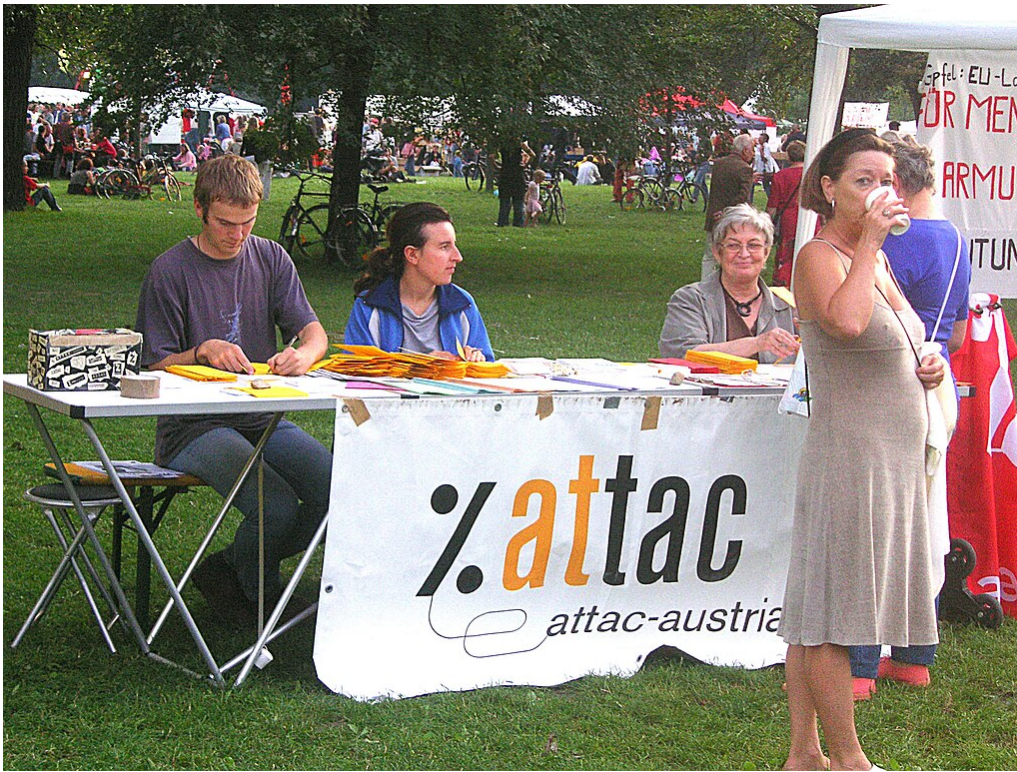
An ATTAC stall at the Volksstimmefest, Vienna, Austria, 2005

Apart from the Tobin tax, ATTAC advanced three other propositions at the World Social Forum: the reform of the World Bank and IMF; a global commission to slow down multinationals and increase competition ; and “a procedure of mediation for countries of the ‘Third World’ in debt, where creditors and debtors should name their representatives and who then have to come to an agreement in regard to an arbitrator ”. All this was to be achieved through “dialogue” with governments and international institutions like the Fund and Bank.[13]