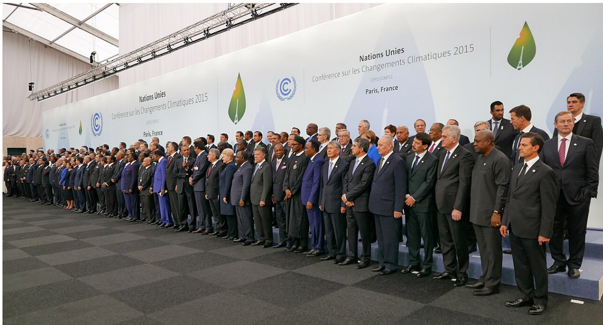
COP 21: Heads of delegations