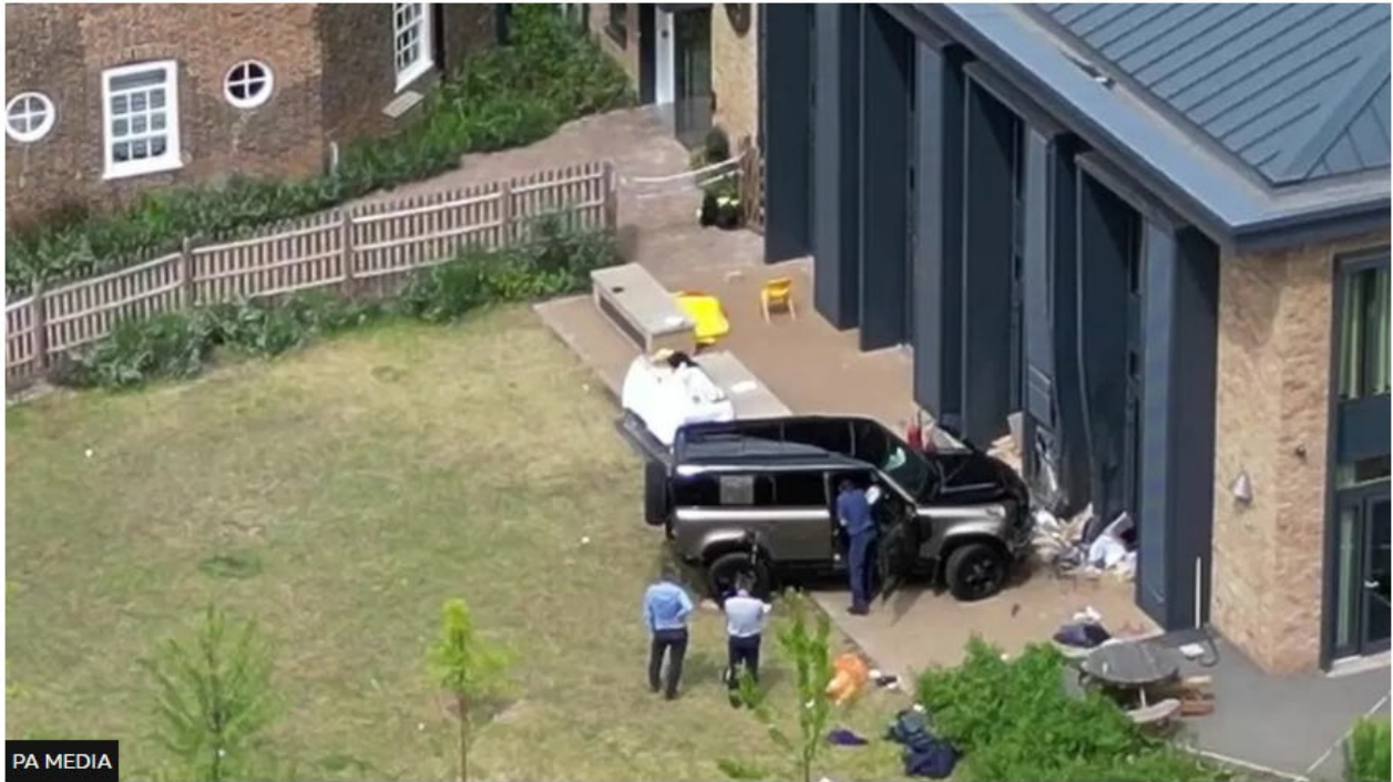
A gold-coloured Land Rover could be seen on school grounds surrounded by emergency responders