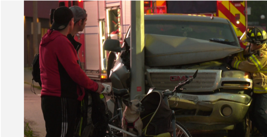
Photo: Passersby watch as emergency responders work at the scene of a fatal crash at 107A Avenue and 99 Street on July 13, 2023.

Published date: Thursday, July 13th 2023 - 6:33 am Modified date: Thursday, July 13th 2023 - 11:38 am