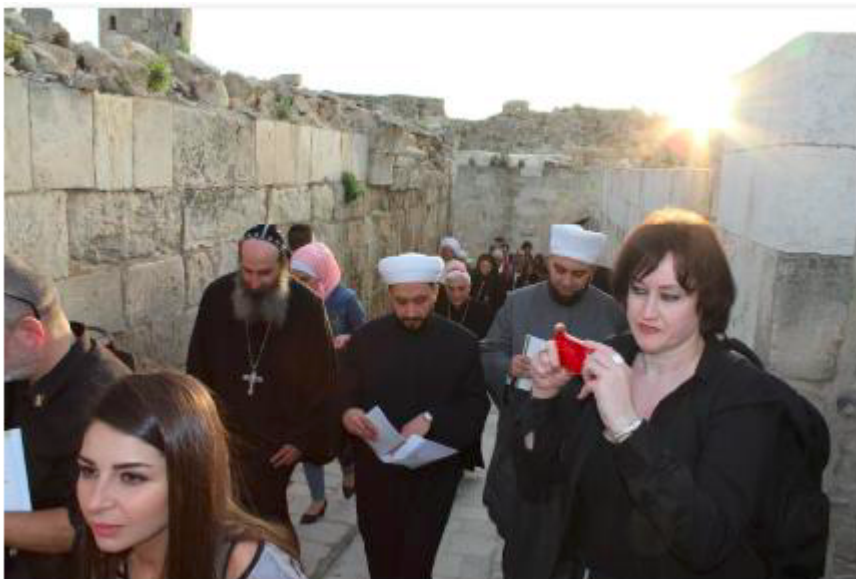
Aleppo Citadel

Terrorists seek to obliterate Syria's tolerant and pluralist identity. Syrians self-identify as Syrians, and not by any religious affiliation.