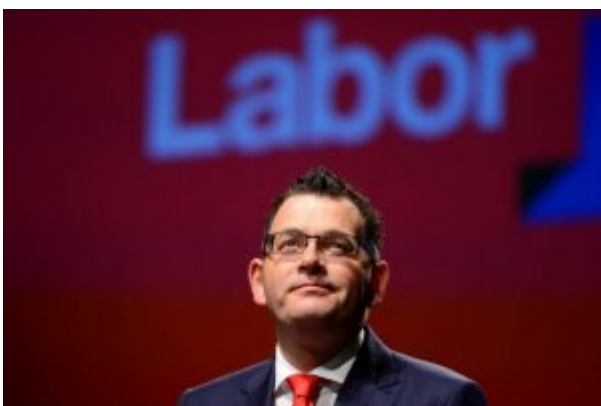
Victorian Premier, Daniel Andrews

It is also worth noting that Hanson is by no means the only one suggesting a vigorous pruning of civil liberties. Her extreme stances merely reflect a broader tendency in Australia’s political classes.