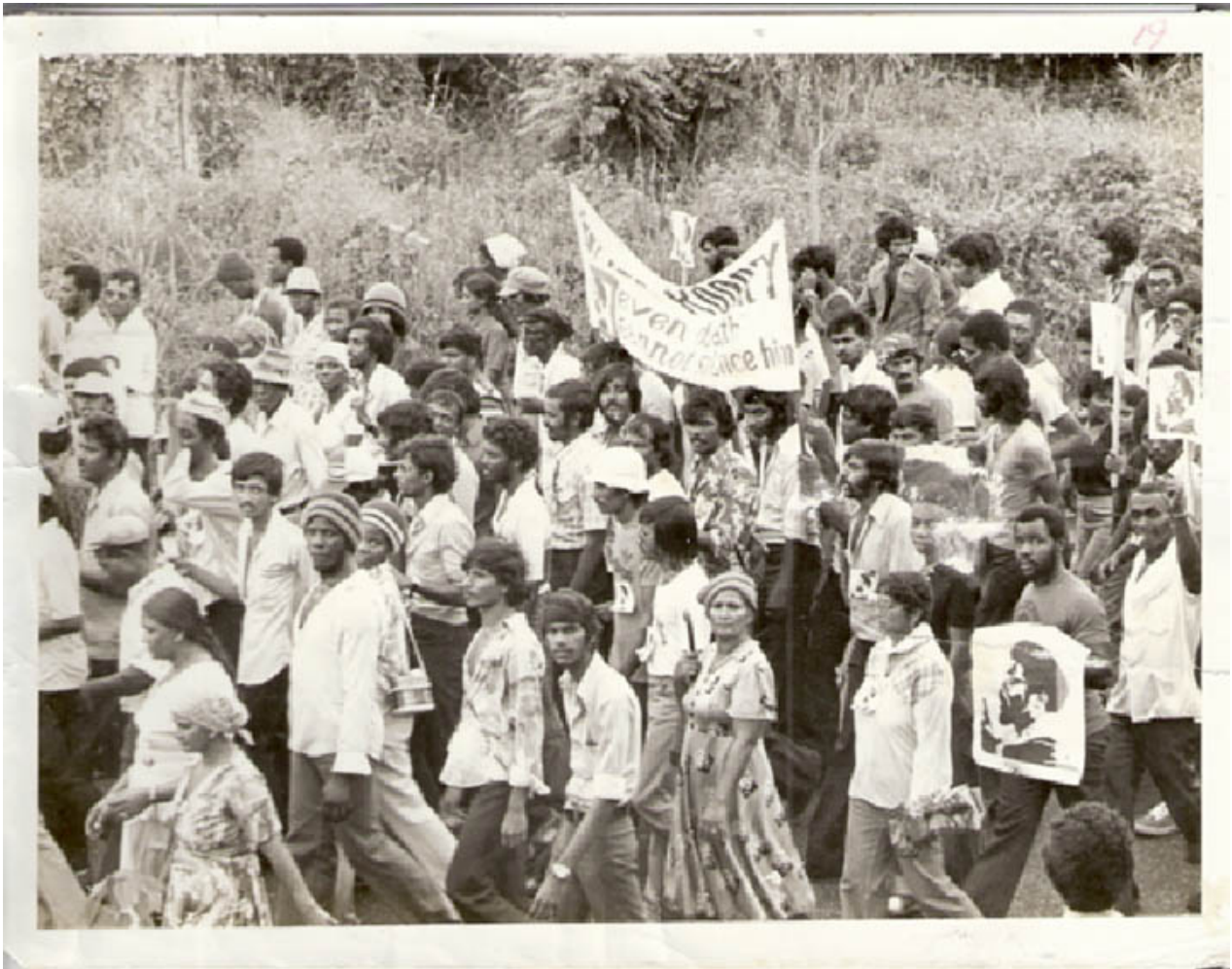
Dr. Walter Rodney's Funeral, June 1980

Rodney was seen by the people as the leader “in the struggle against the dictatorship.”[39] The Burnham government viewed the WPA and Rodney as a threat to its stability. Their agitational and mobilizing work for justice and call for unity of the Indian and African working people put the state on the defensive. Rodney did not shy away from doing this oppositional work notwithstanding the danger to himself.[40] Rodney was assassinated on 13 June 1980 and the Burnham regime removed this revolutionary from the stage of history.