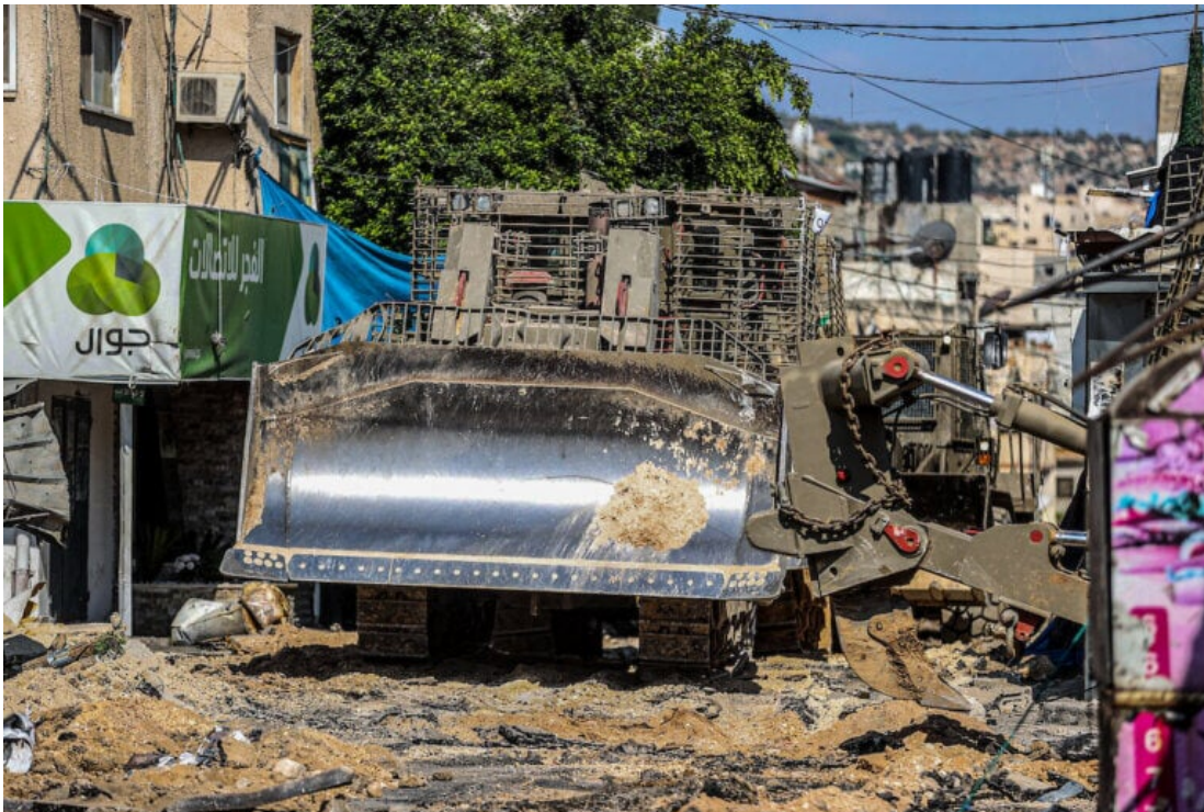
An Israeli military bulldozer seen leveling roads and destroying the center of the Jenin refugee camp during a raid on the camp near the West Bank City of Jenin, July 3, 2023.