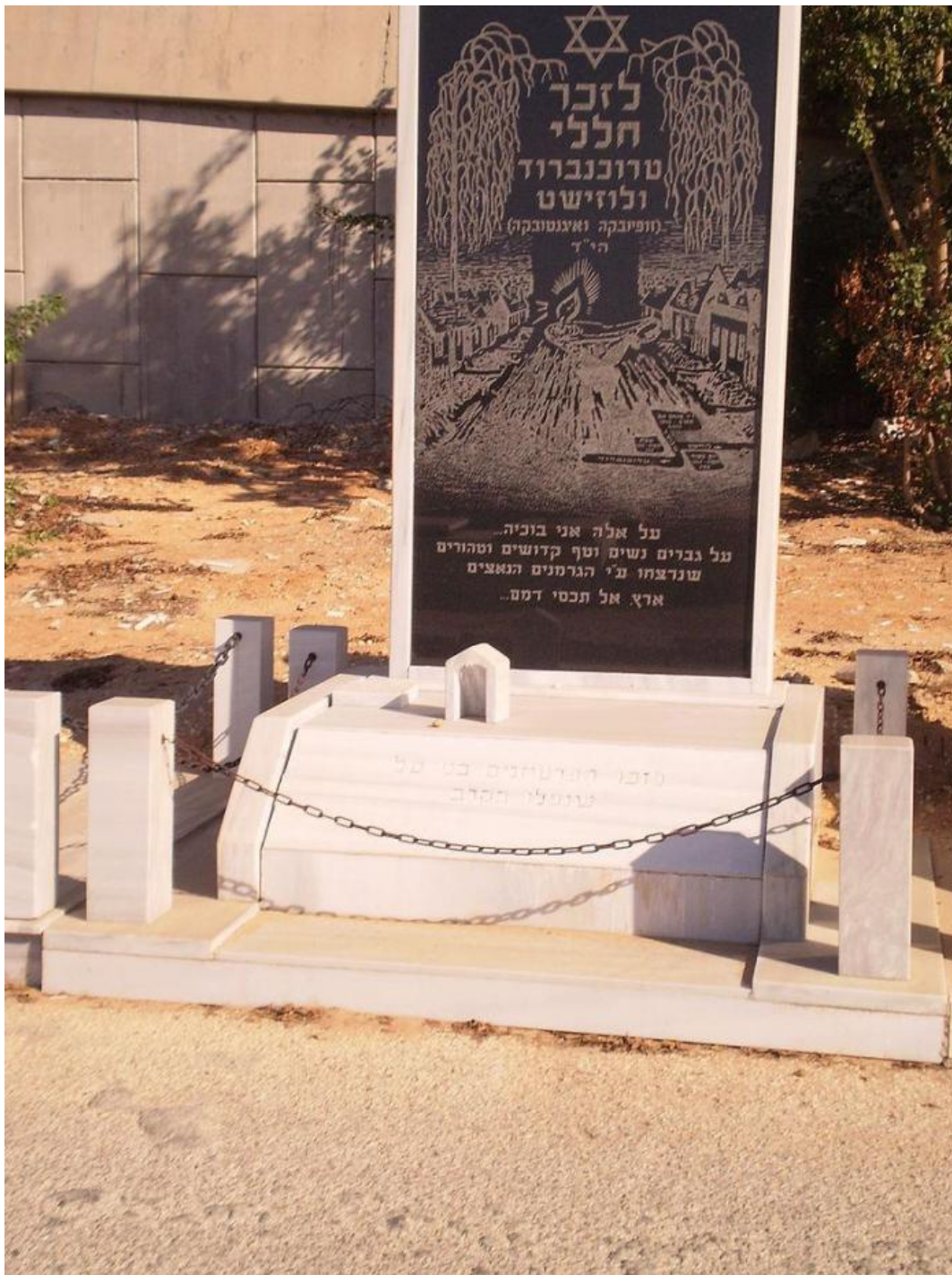
Holocaust memorial to Trochenbrod and Lozisht Jewry at the Holon Cemetery in Israel.

Given this history and the dirty war that western Ukraine's coup regime has waged on its eastern regions for eight years now, Americans should ask their government to cease supporting Ukraine's western government.