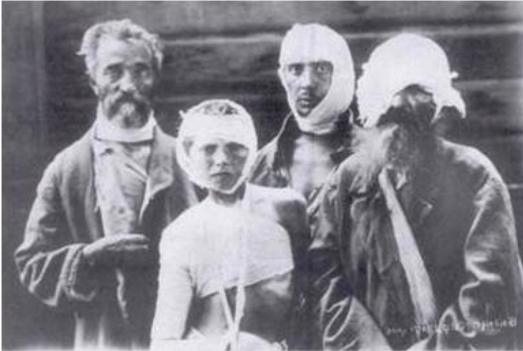
Victims of Kyiv pogrom in 1918.

More pogrom-like violence by “Ukrainian Nationalists, Polish officials, and Red Army soldiers...” killed tens of thousands of Jews between 1918-1920. [14] This contributed to my grandfather moving to Maryland by the end of the 1920s. [15]