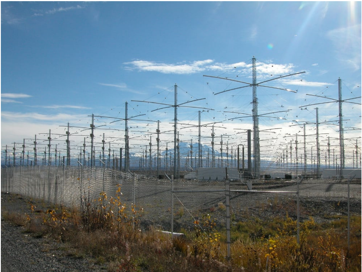
HAARP array of antennas. Gakona, Alaska

It is worth noting that the HAARP program was acknowledged by a CBC Program as early as 1996