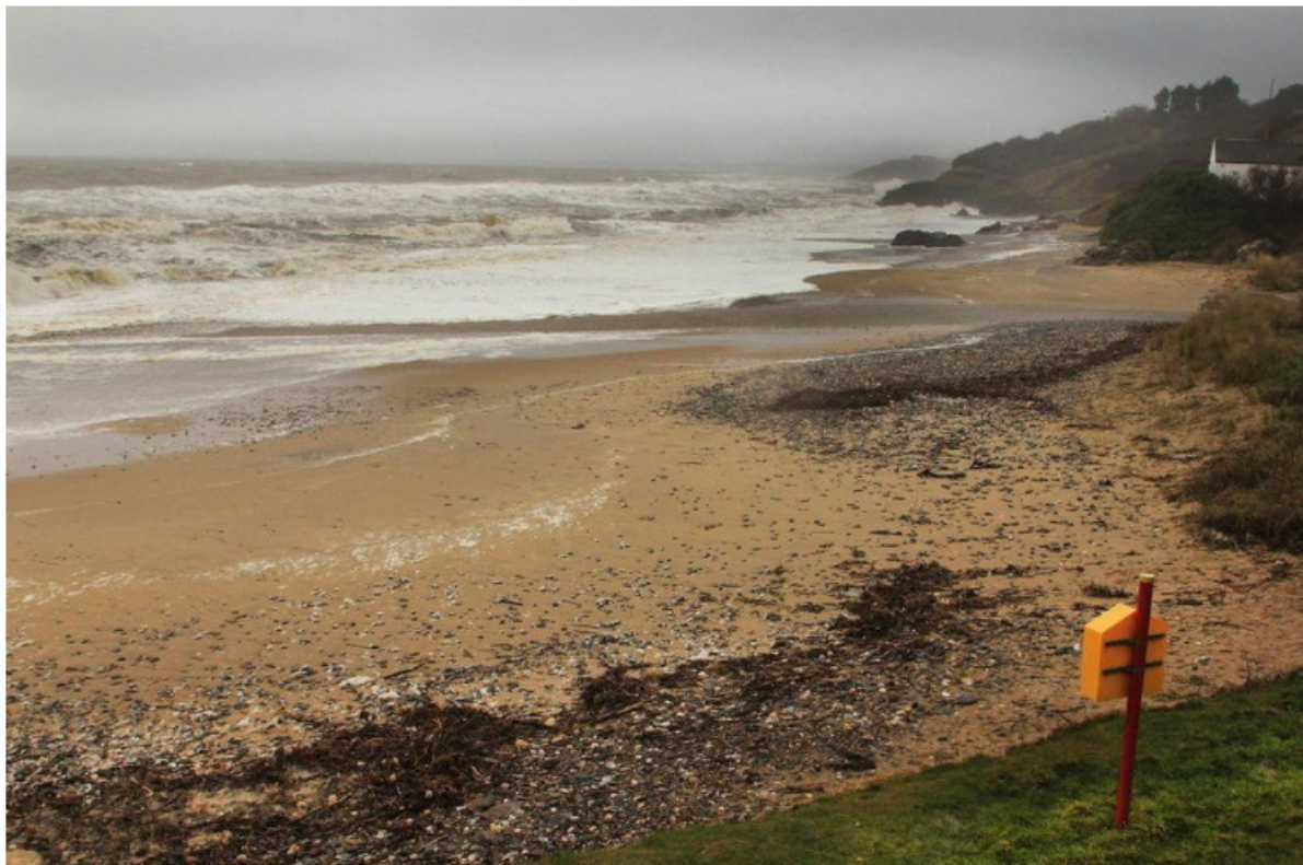
Ballymoney Beach, Wexford.

The woman's body was subsequently taken to the mortuary at University Hospital Waterford (UHW) where a post-mortem examination will be carried out and a file prepared for the coroner.