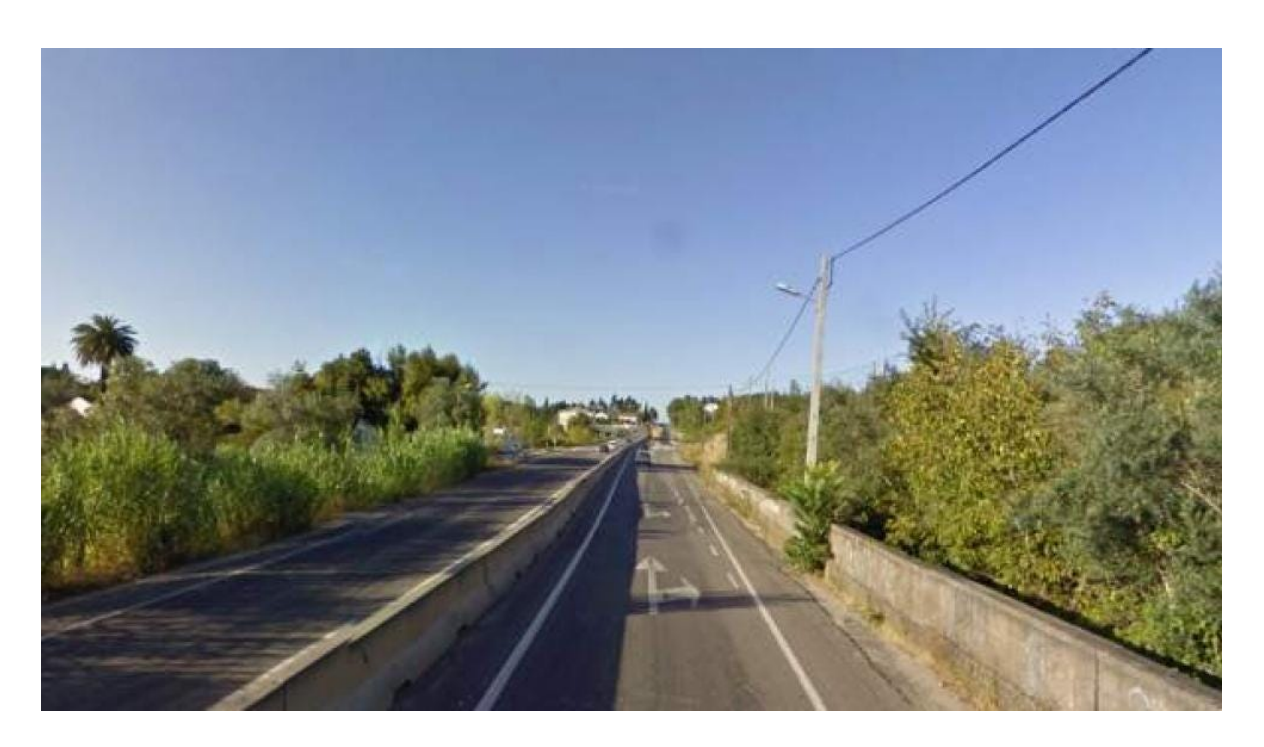
Italy – bus driver collapsed on steering wheel, teachers took control of bus and saved 52 children, on March 6, 2023 (click here)