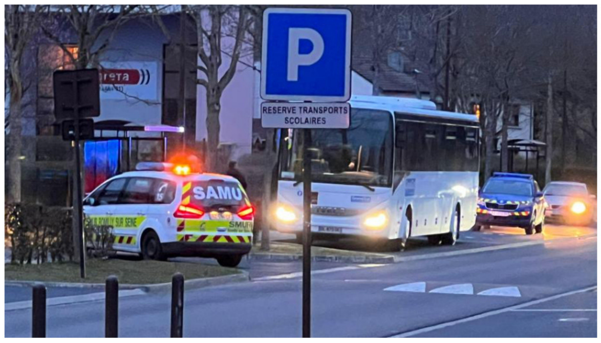
The driver was parked on the bus lanes in front of the school city of Sézanne. - Jérôme Lefèvre

A victim of heart discomfort, a bus driver died in front of the school city of Sézanne (Marne). The students on the bus were evacuated.