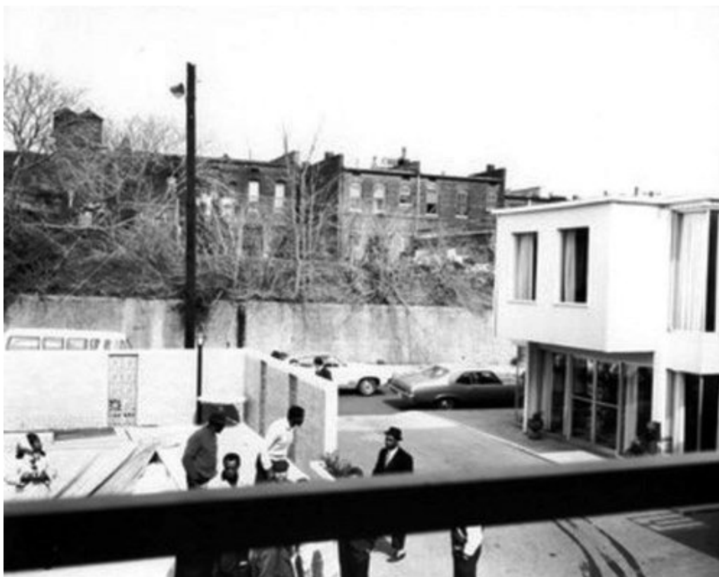
View from Lorraine Motel balcony that shows brush area from where witnesses claimed the shots were

Instead, it must have come from the bushes behind Jim’s Grill and between the rooming house and motel.