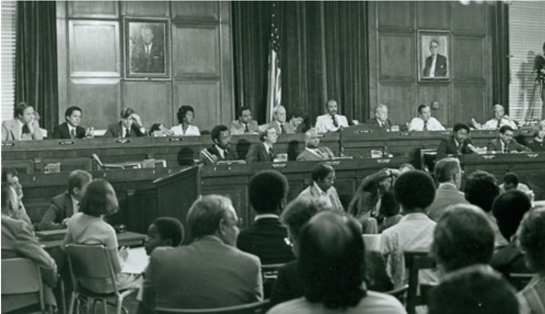
House Select Committee on Assassinations.

In 2012, G. Robert Blakey, staff director to the HSCA, said, however, that he had been deceived by the CIA—which had failed to inform him that a government liaison to the HSCA, George Joannides, had a CIA background. Blakey told the Jackson, Mississippi, Clarion-Ledger that “thoughtful people today, not just nuts, think that more people than James Earl Ray were involved [in King’s killing].” [5]