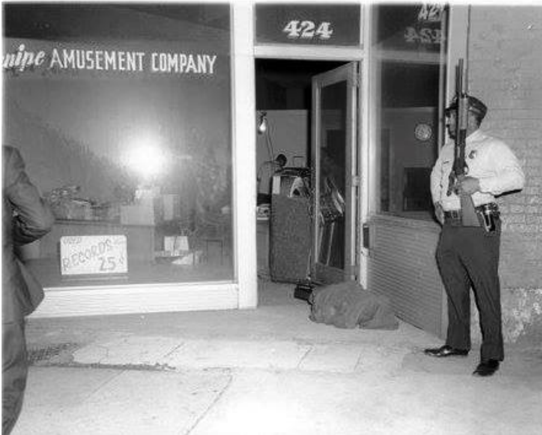
Bedspread with rifle dropped by Ray allegedly in panic outside the Canipe Amusement Company.