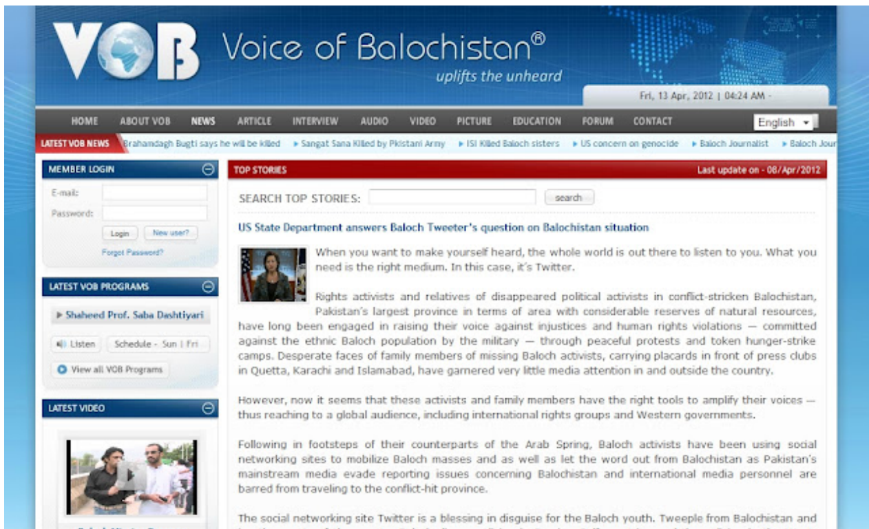
Image: A screenshot of “Voice of Balochistan’s” special US State Department message . While VOB fails to disclose its funding, it is a sure bet it, like other US-funded propaganda fronts, is nothing more than a US State Department outlet. (click image to enlarge)