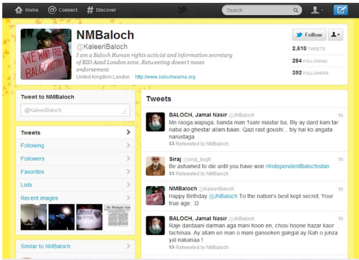
Image: A screenshot of a “Baloch Human rights activist and information secretary of BSO Azad London zone” Twitter account. This user, in tandem with look-alike accounts has been propagating anti-Pakistani, pro-“Free Baluchistan” propaganda incessantly. They also engage in coordinated attacks with prepared rhetoric against anyone revealing US ties to Baluchistan terrorist organizations.