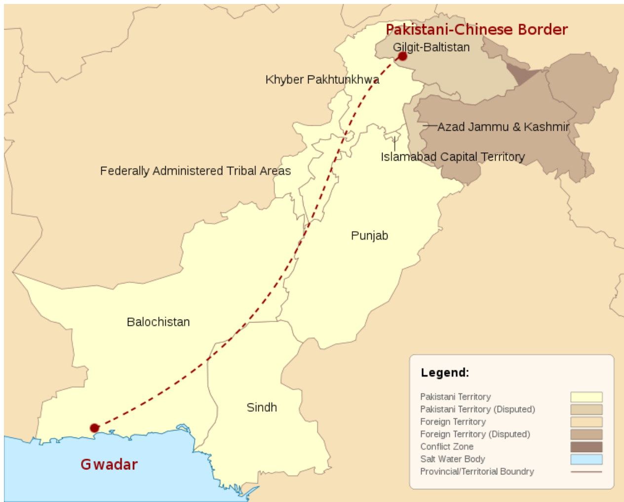
Image: Why Baluchistan? Gwadar in the southwest serves as a Chinese port and the starting point for a logistical corridor through Pakistan and into Chinese territory. The Iranian-Pakistani-Indian pipeline would enter from the west, cross through Baluchistan intersecting China's proposed logistical route to the northern border, and continue on to India. Destabilizing Baluchistan would effectively derail the geopolitical aspirations of four nations.