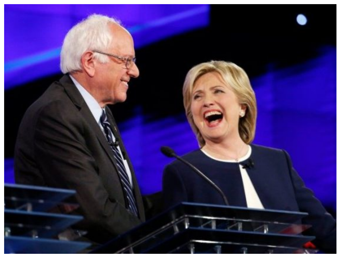
INFLATED: The media are trying to prop-up Hillary's falling popularity, but according to the polls, Bernie had the last laugh.

Clinton poor polling numbers are validated by a nonpartisan poll conducted by <u>Reuters</u> in the week prior to this debate, which shows Clinton on a downward slope. From October 4 to October 9, Clinton's support dropped ten whole points – from 51 to 41%.