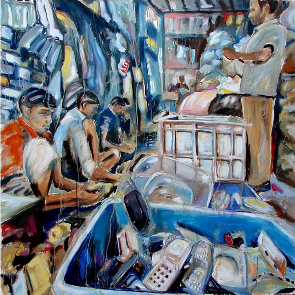
Phone Recycling, Mumbai, India Oil on canvas (150cm x 150cm / 59.1 in x 59.1 in)

In many slums around Mumbai people worked in traditional industries such as pottery and textiles. Now there is a growing recycling industry processing waste from other parts of Mumbai. Many of these industries are carried out in one-roomed factories manufacturing products that are distributed globally. While there have been some projects set up to improve living conditions, Dharavi remains a source of cheap labor for local and foreign investors.