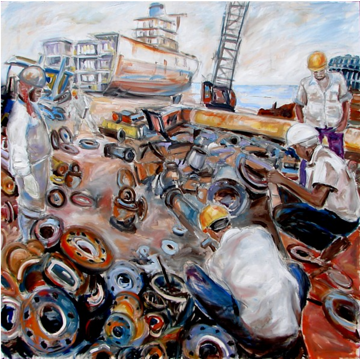
Ship Dismantling, Alang Shipyard, India Oil on canvas (150cm x 150cm / 59.1 in x 59.1 in)

Many ships such as supertankers, car ferries and container ships are dismantled on the beach at Alang in the state of Gujarat, on the west coast of India. Thousands of people work in this industry and millions of tons of steel and other materials are recovered and then sold as scrap. However, it is a very dangerous business and the process maims and kills many workers each year and the shoreline is contaminated with oily waste, asbestos, toxic paint and other toxic materials.