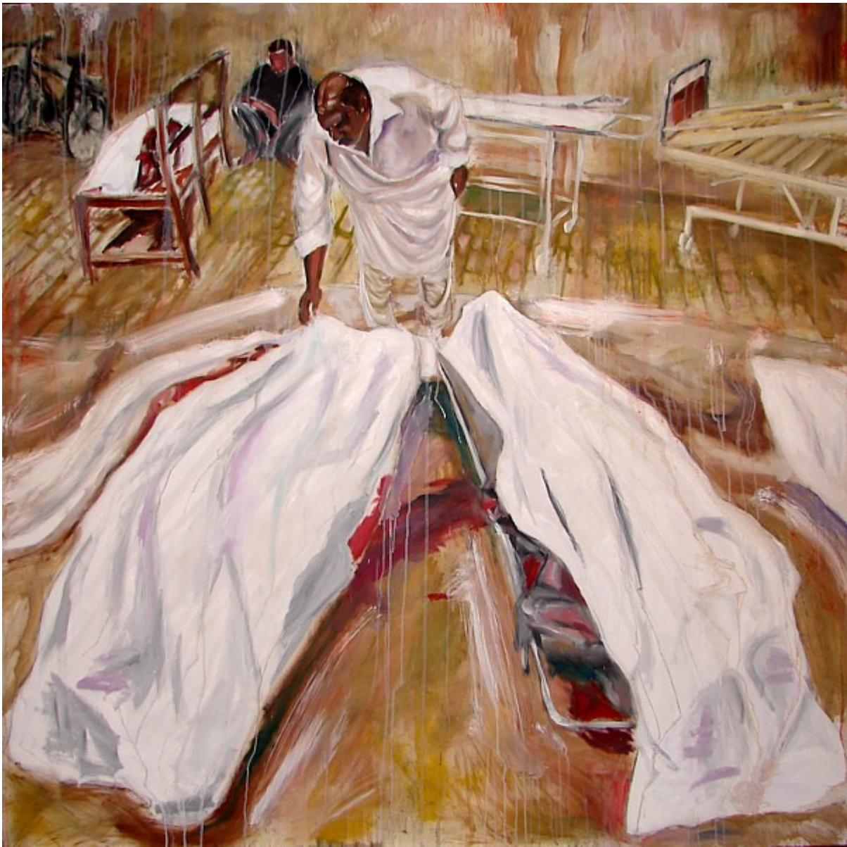
Aftermath of Suicide Bomber, Morgue in Rawalpindi, Pakistan Oil on canvas (150cm x 150cm / 59.1 in x 59.1 in)

A man looking for relatives at a morgue in Rawalpindi in Pakistan after a suicide bombing in which at least 35 people were killed and dozens more wounded in November 2009. Soldiers and civilians had gathered outside a branch of the National Bank of Pakistan to collect their monthly salaries and pension payments when the bomb exploded.