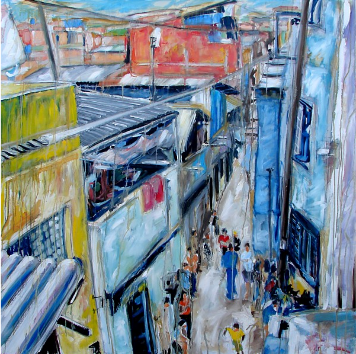
Favela, Rio de Janeiro, Brazil

Oil on canvas (150cm x 150cm / 59.1 in x 59.1 in)