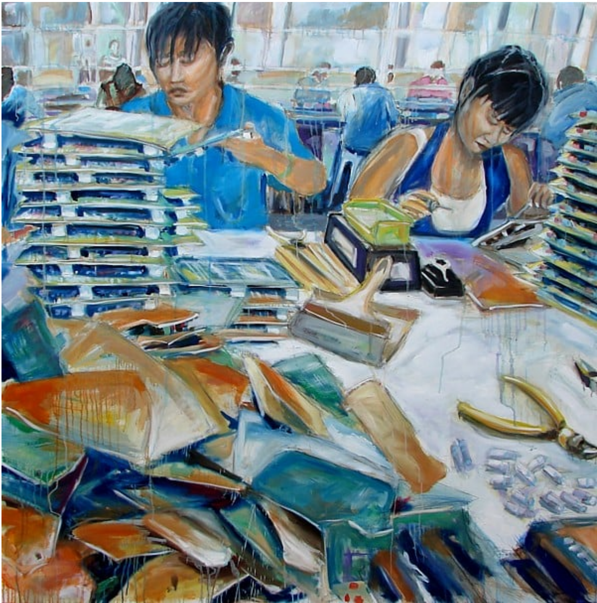
Soldering Circuit Boards, Toy Factory Shantou, Guangdong, China Oil on canvas (150cm x 150cm / 59.1 in x 59.1 in)

Factory conditions in China have come under much criticism for issues such as subsistence wages, long working days, seven day weeks and illegal overtime hours. In some cases workers need permission to leave the factory grounds and live in cramped conditions sharing large dorms. Foreign investors, who have a huge presence in China, often violate the most fundamental human and worker rights. Opposition to such conditions can lead to being fired, or even arrest and imprisonment.