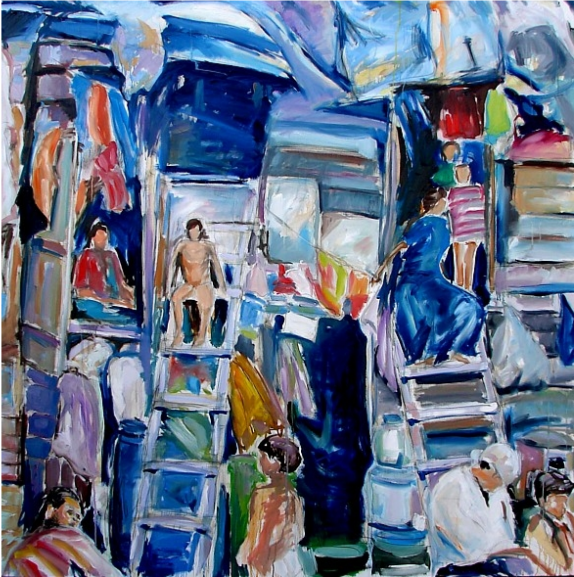
Dharavi Slum, Mumbai, India Oil on canvas (150cm x 150cm / 59.1 in x 59.1 in)

While Dharavi has been featured in films such as Danny Boyle's 2008 film Slumdog Millionaire , the difficulties such as sanitation issues, an inadequate water supply, overcrowding and poverty faced by people who live there are some of the worst in the world. It is estimated that around 1 million people live in Dharavi making it one of the largest slum in Asia.