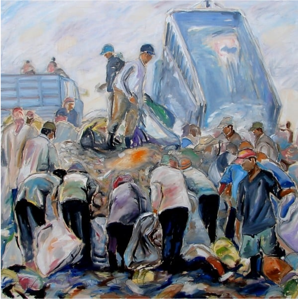
Rubbish Dump Recycling, Phnom Penh, Cambodia Oil on canvas (150cm x 150cm / 59.1 in x 59.1 in)

It is believed that over 3000 scavengers live and work around the Stung Meanchey municipal rubbish dump situated on the outskirts of Cambodia's capital city Phnom Penh. Many of the scavengers are children who have to leave school to earn money for their families. They work up to 14 hours a day looking for glass, plastic, metal and any other materials which can be recycled. Fumes from burning rubbish, dirty needles, flies and truck accidents pose huge threats to the safety and health of the workers there.