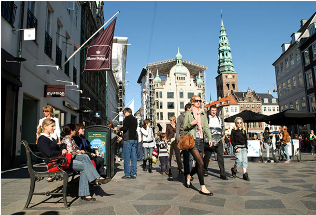
‘Normal life’ – a scene from Amagertorv Strøget in Copenhagen, Denmark

Unlike in the UK, the Danish Teachers Union did not take to the media to try and hold government and schools hostage by threatening to strike if the State could not guarantee all schools were “safe” for teachers. Instead, there were sane and measured discussions, and genuine cooperation between the government and the teachers’ unions. Interestingly, both parties allowed the schools to be the final authority on how to conduct the business of managing schools and education.