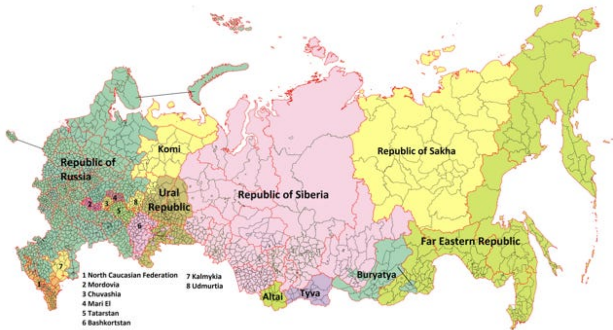
One of the many maps drawn up by fantasists who dream of partitioning Russia into a collection of smaller independent states

This panel is being led by four women and one man, all of whom have cycled through the NGO Regime Change Complex, whether it be the International Crisis Group, Radio Liberty/Radio Free Europe, the German Marshall Fund, the Soros Foundation, and so on. There are too many groups in total that they have collectively worked for to list, so we won't do that. Instead, here are their names and bios: