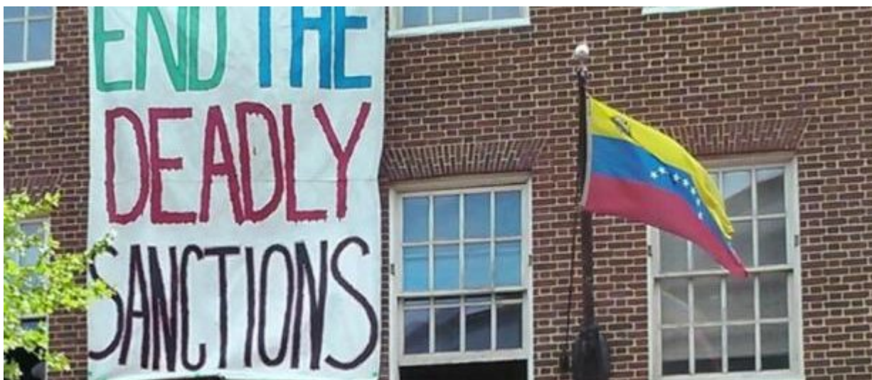
End Venezuela Sanctions sign on the Venezuela Embassy, from Venezuela Embassy Protectors Collective.

This is an opportunity to change direction. What seemed impossible in the recent past is now possible. We must seize the opportunity to create change that ensures the necessities of the people are met and the planet is protected. COVID-19 is one immediate crisis, but the climate crisis, nuclear war and economic insecurity all require solidarity between the people of the world.