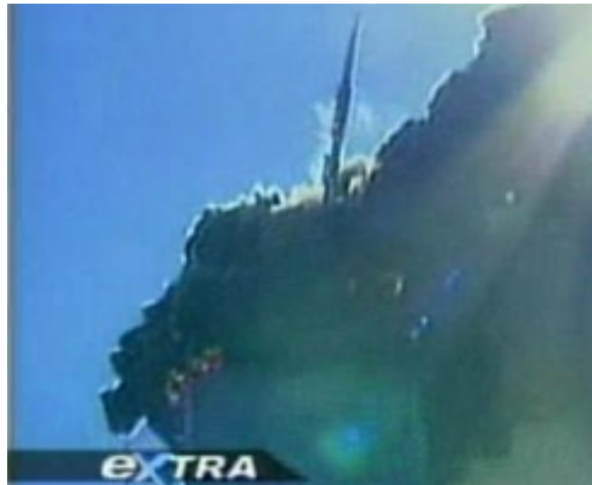
Initiation of collapse of the North Tower (shown from the south side)

But PM notes other issues regarding the Towers' collapses, quoting structural engineer Jon Magnusson as saying: