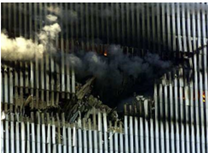
Impact zone of the North Tower (shown from the north side)

But that aside, it is important to quantify how the structural damage played a role in the collapse of the Towers. We previously noted that the collapse of the Towers started on floors with less damage than other floors. In the case of the North Tower, the collapse started at the 98th floor, 6 which had the least amount of structural damage out of all the damaged floors. 7 Not only that, but the upper section of the North Tower started to collapse on the side of the building opposite to where the plane impacted.