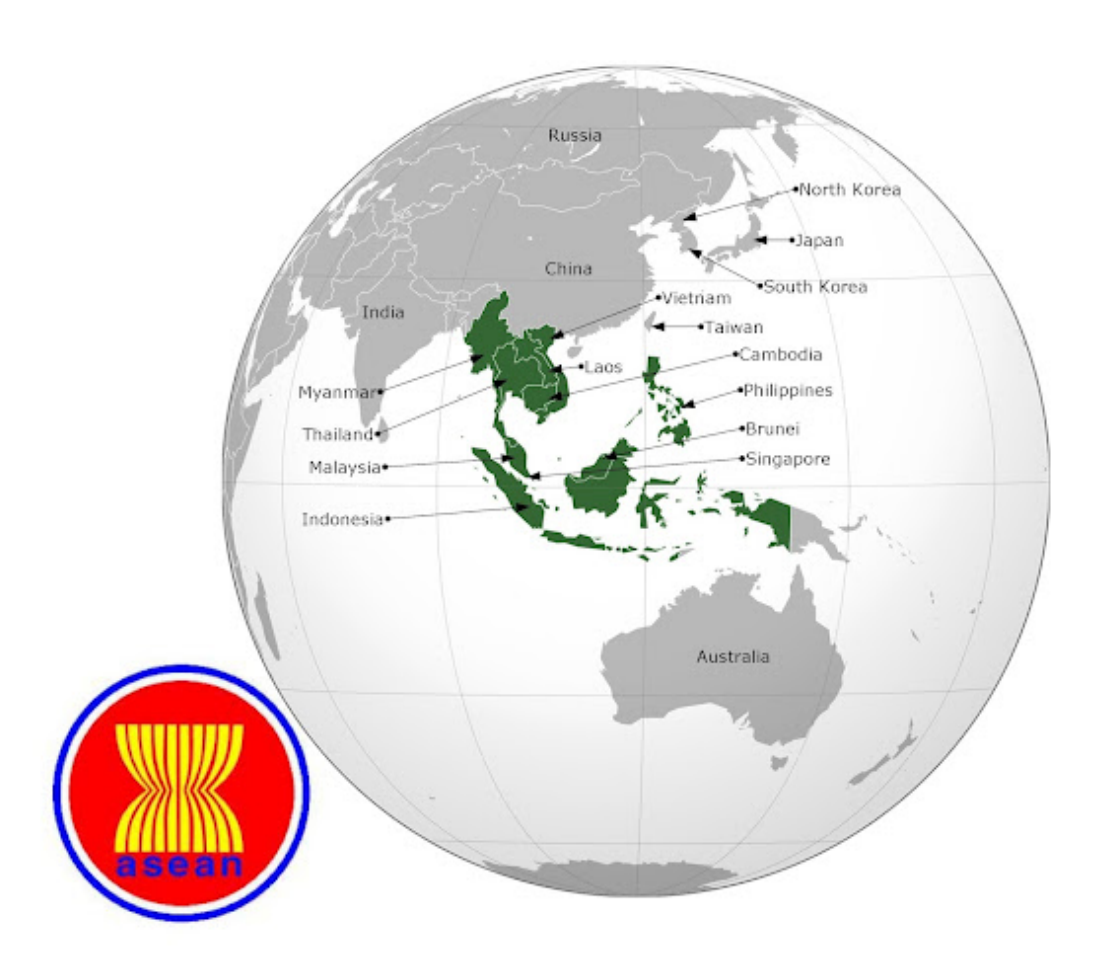
Image: The supranational ASEAN bloc consists of Myanmar, Thailand, Laos, Vietnam, Cambodia, Malaysia, Brunei, Indonesia and the Philippines with a combined population of 600 million (as of 2010). The logo of bound rice padi stalks allegedly represents all of

But China is a vast nation, and this Afro-Eurasian front stretching from Africa to the Himalayas still isn't big enough. In Southeast Asia, the West is attempting to create a European Union-style supranational bloc – the Association of Southeast Asian Nations (ASEAN). Its proponents and leadership are notorious servants and affiliates of institutions synonymous with Western hegemony.