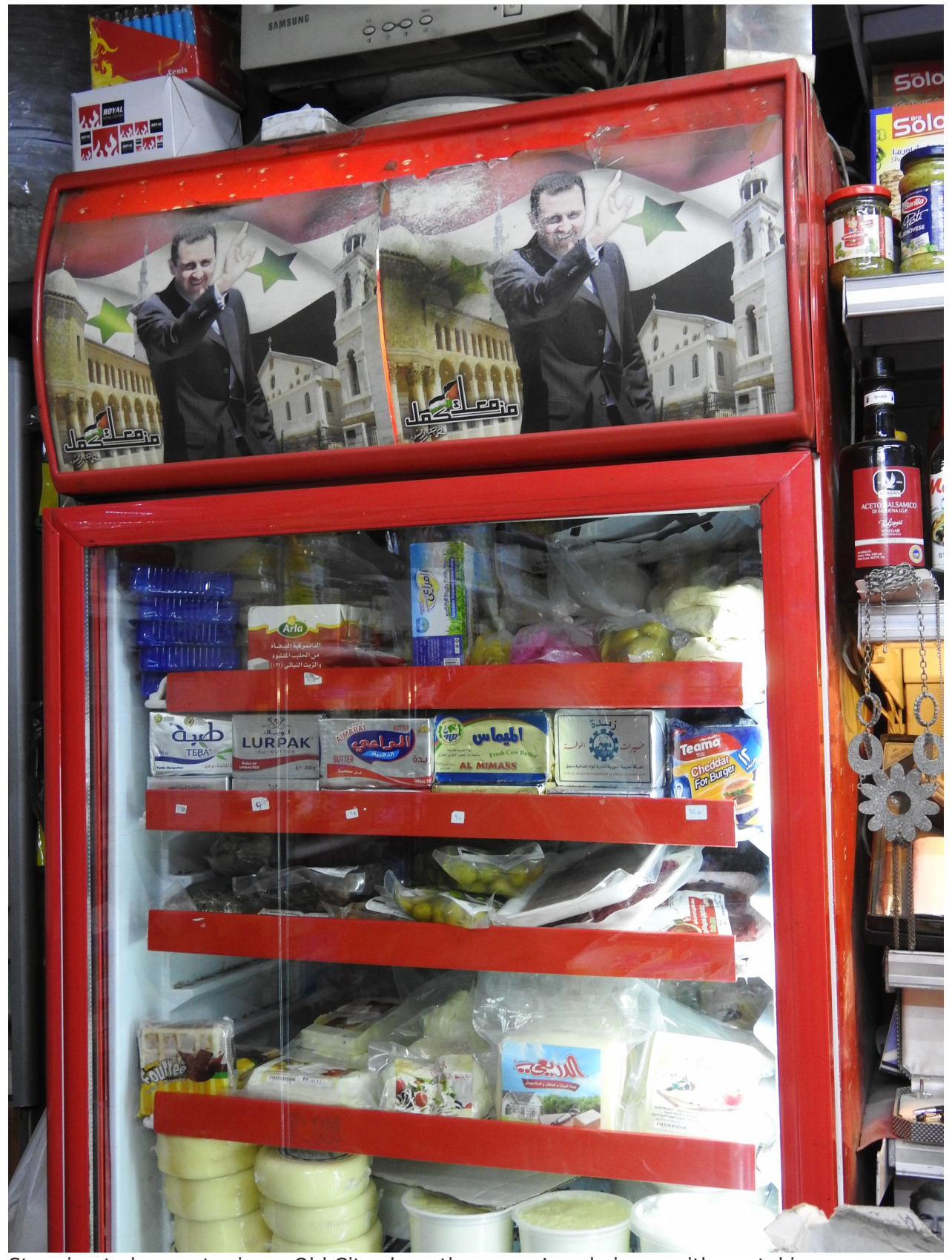
Stopping to buy water in an Old City shop, the owner's only issue with me taking a photograph of his fridge is that he wants to dust off the photos of President Assad a bit first, apologizing that they are old, from well-before the current crisis.