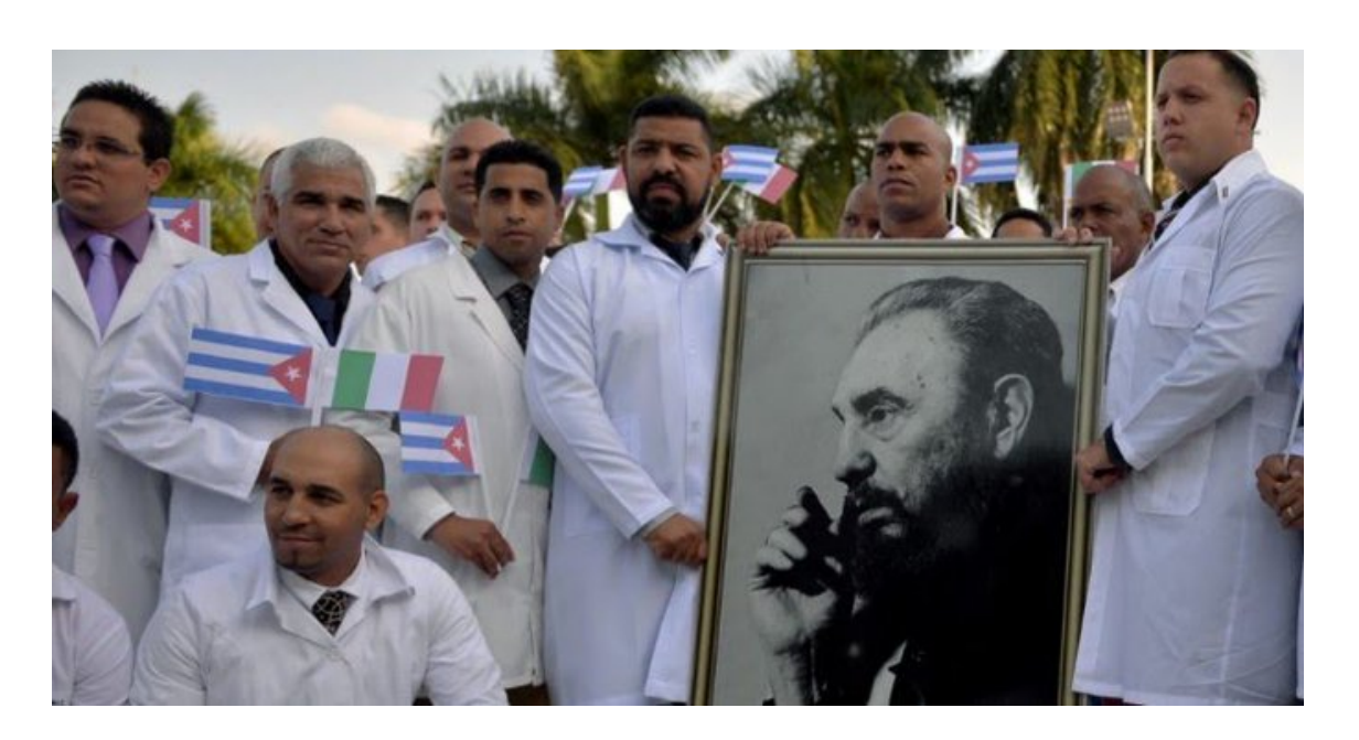
Cuban healthcare workers holding portrait of Fidel Castro

The U.S. has far more COVID-19 infections and deaths than any other country in the world. Yet the White House has continued to heighten the blockade against Cuba and intensify destabilization efforts against the Bolivarian Republic of Venezuela.