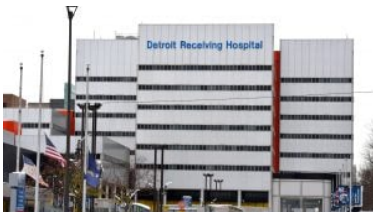
Image on the right: Detroit Receiving Hospital during the COVID-19 outbreak in the city

A much nationally-championed public relations campaign suggesting that Detroit is undergoing an economic resurgence is largely based upon developments in the service and hospitality sectors. Obviously a major setback for this narrative is the closing of the casino hotels downtown which will remain shuttered for many months to come depriving the municipality of millions in tax revenue.