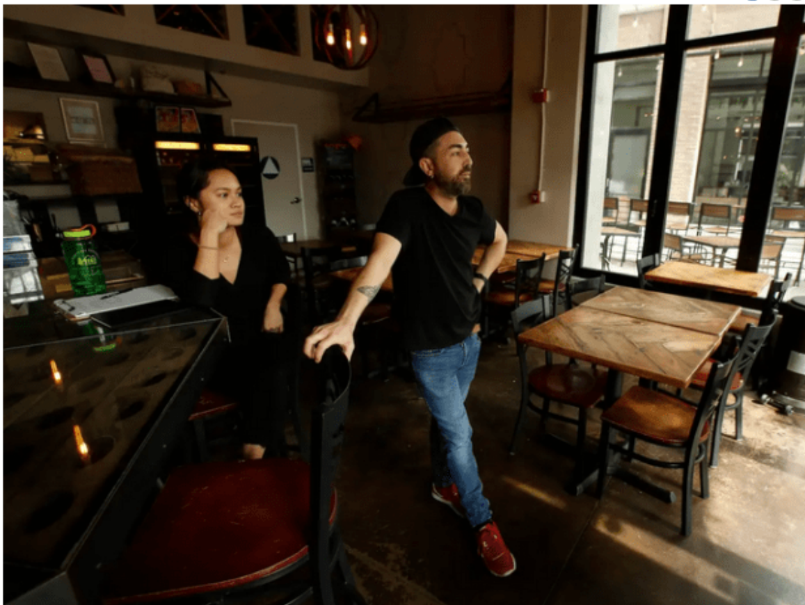
Employees stand in the empty dining room of a Sacramento, California, restaurant on March 17, 2020.

March 31 2020 , Business Insider : "RESTAURANT APOCALYPSE: More than 110,000 restaurants expect to close up forever in the coming weeks, with millions out of work and the industry's future uncertain."